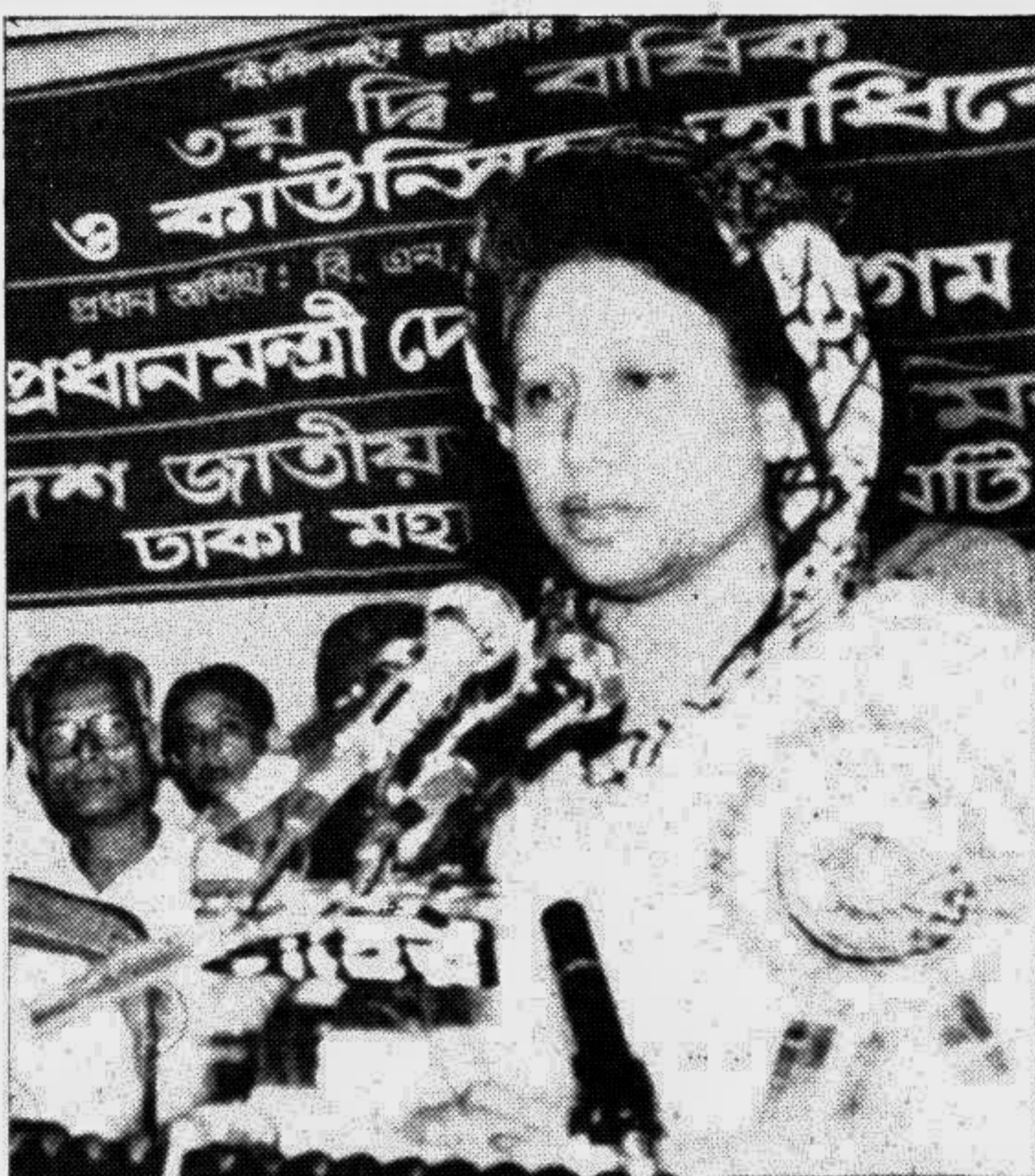
Prime Minister Begum Khaleda Zia addressing the third biennial conference of the Jatiyatabadi Sramik Dal, Dhaka city unit, at the Institution of Engineers yesterday.

Prime Minister Begum Khaleda Zia yesterday rebutted opposition charges, saying those who were steeped in corruption while in power are now accusing ministers to malign the popular BNP government, reports UNB. In an oblique reference to the Awami League, she said an opposition political party had launched a propaganda campaign to discredit her democratic government. "They have now joined hands with those ousted in a mass movement for indulging in corruption and chaos," Begum Zia said, inaugurating the 3rd biennial council of the Dhaka city unit of the Bangladesh Jatiyatabadi Sramik Dal, the labour front of the ruling BNP, at the Institution of Engineers. "They are out to destroy the country by obstructing the development activities initiated by the present government," she warned. Continuing her scathing criticism to the opposition which has brought corruption charges against some of her cabinet colleagues in and outside Parliament, the Prime Minister reminded all that the wrong policies, corruption and