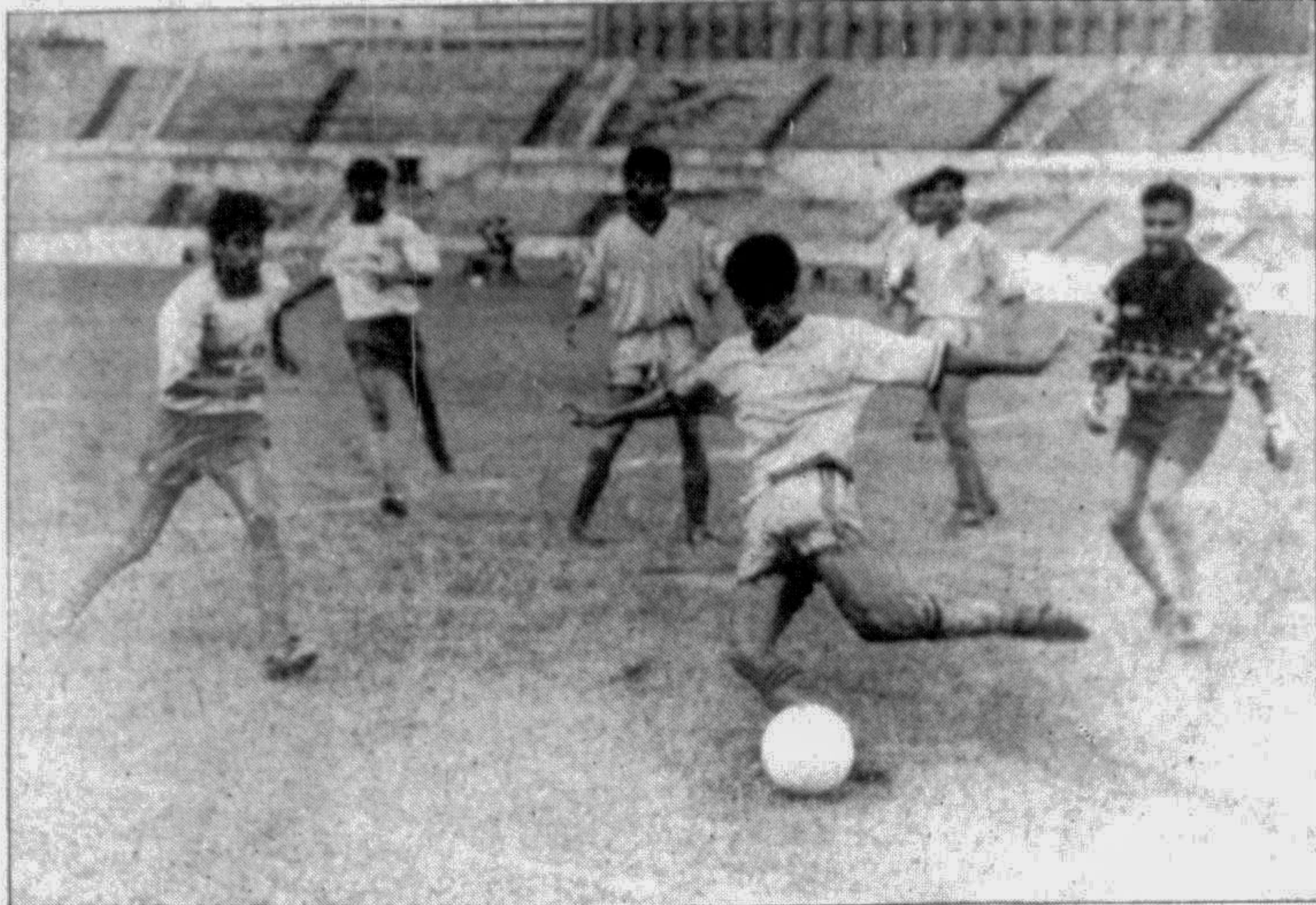
Scene from yesterday's Star First Division football league encounter between Eskaton Sabuj Sangha and newcomers Bangladesh Boys.