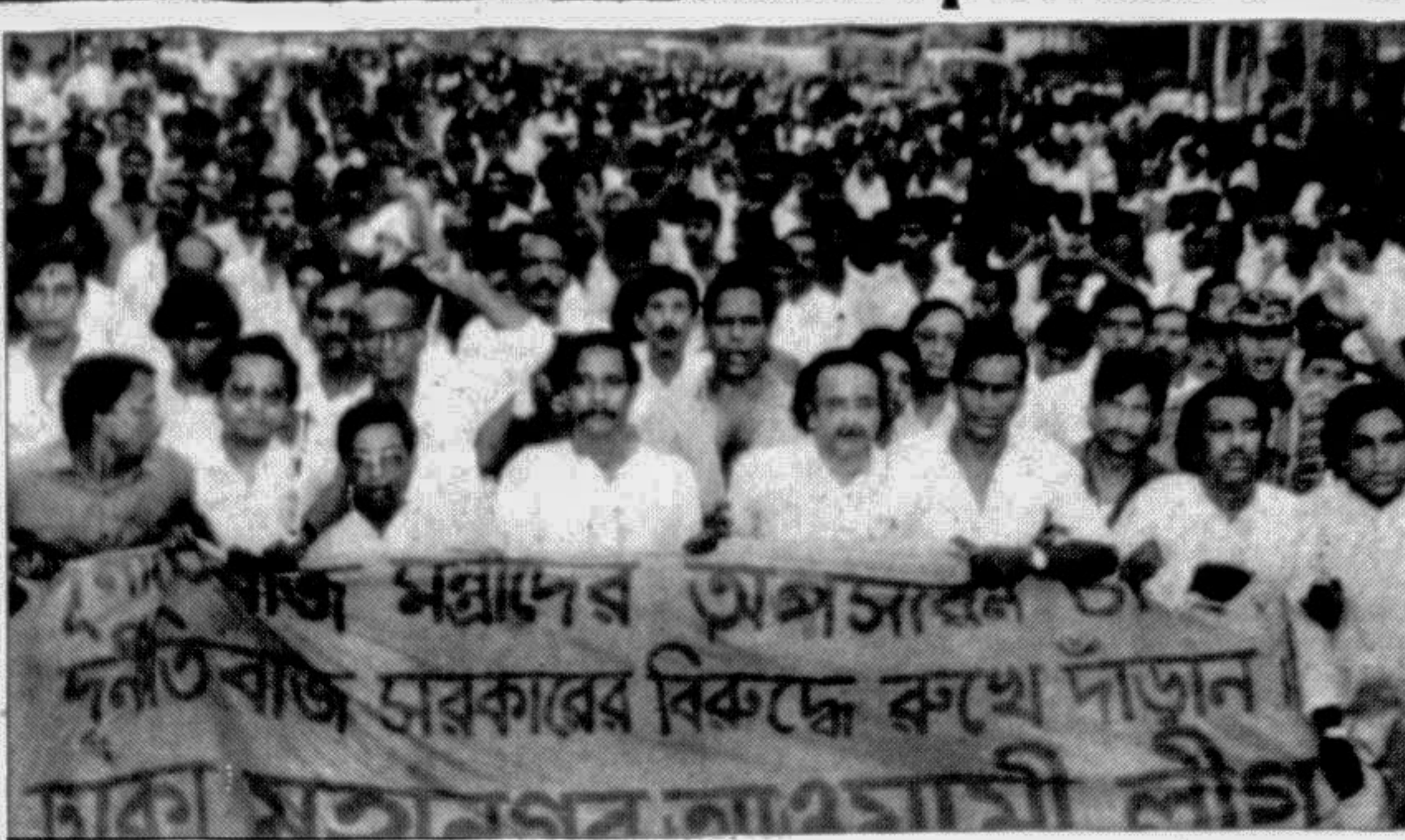
Dhaka City Awami League brought out a procession demanding cleansing of corruption in ministries.