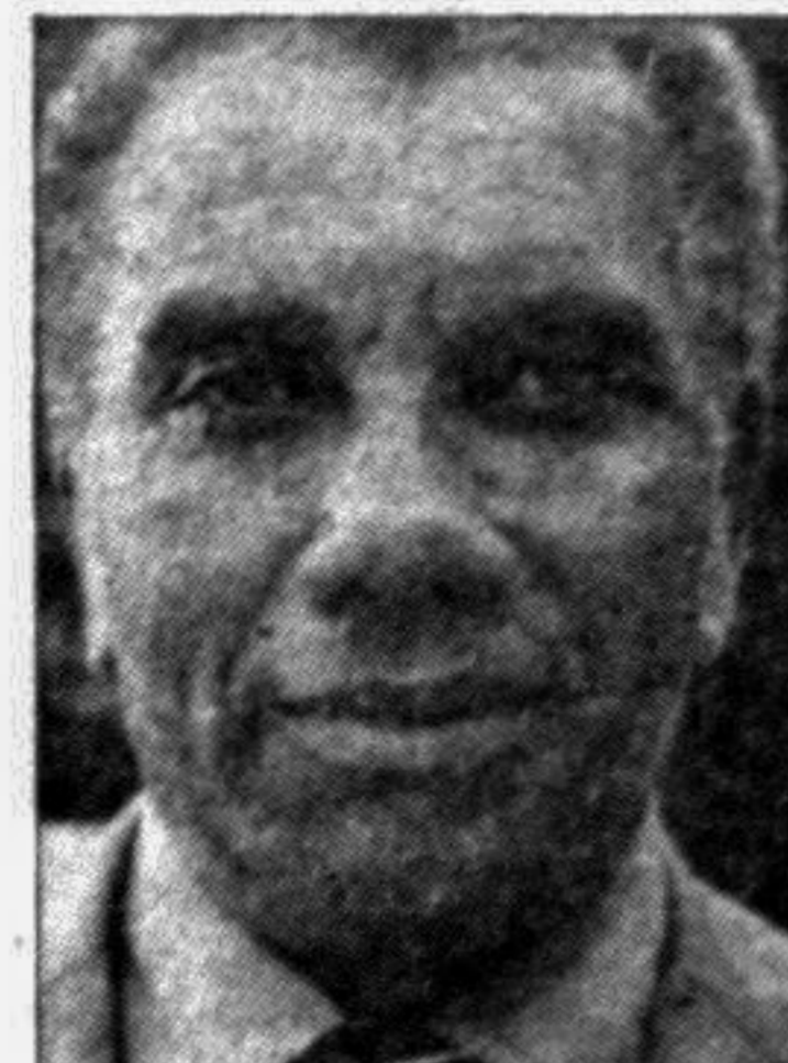
WALCOTT... new ICC chief

Pakistan's suggested alternatives were two bouncers per batsman per over or to apply the existing regulation to unrecognised batsmen only.