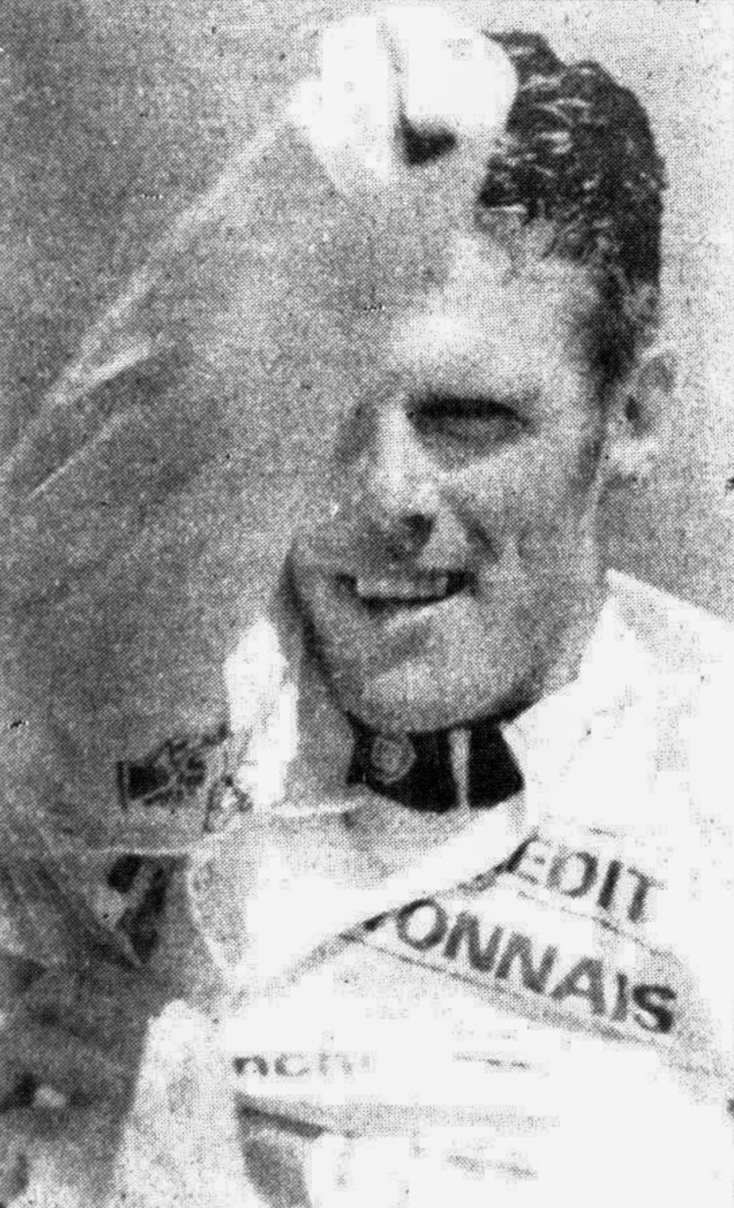
The leader of the Italian team GB-MG, Mario Cipollini puts on the yellow jersey after having won the fourth stage of the Tour de France on July 7 in Avranches, France.

With 13 wins from 16 games, Antlers cannot now be caught by second-placed Yokohama Marinos or Ichihara JEF United before the season midpoint, even if they lose both remaining games.