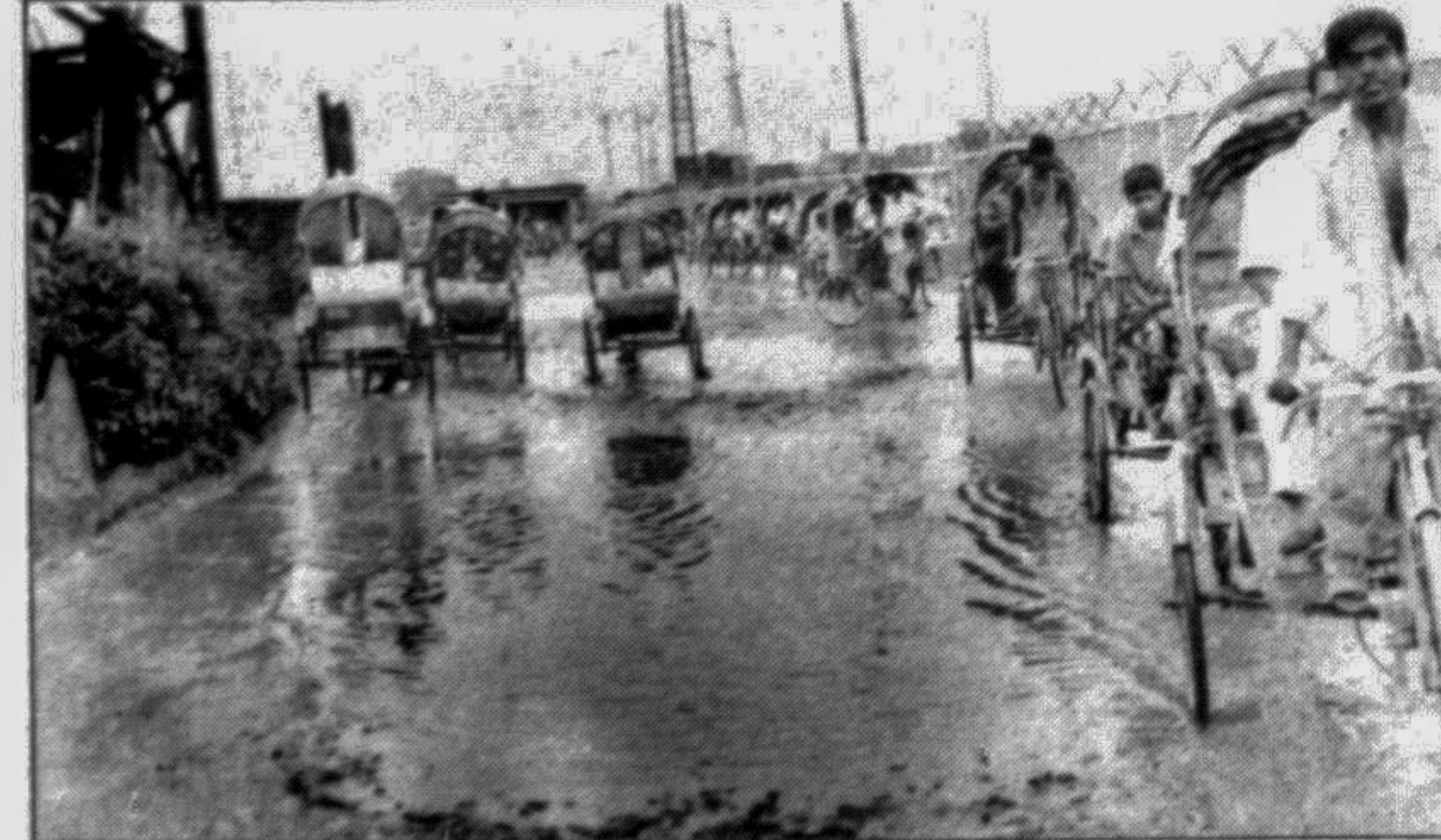
The only connecting road between Kamalapur and Mughdha lying in dilapidated condition for a long time causing miseries to thousands of people everyday.