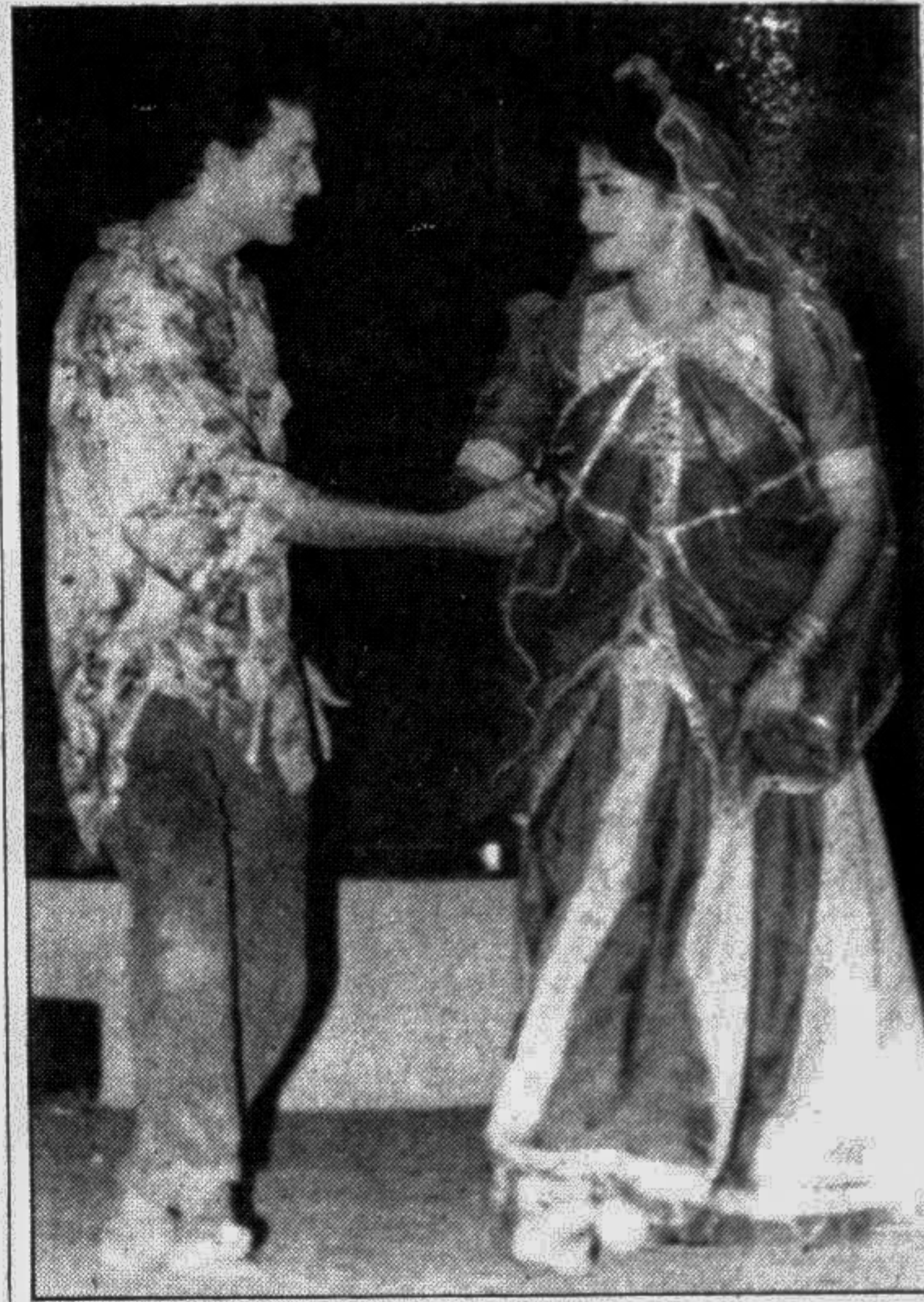
A sequence of the drama 'Kunjush' staged Tuesday at the Guide House auditorium to mark Lok Nattiyada's completion of 12-year.

The police also found 45 empty bottles of phensidyl in the raid. A case has been filed with the Kotwali police station in this connection. Meanwhile, the DB police also recovered a 100cc Honda motor bike from Shempara under Mirpur thana Tuesday.