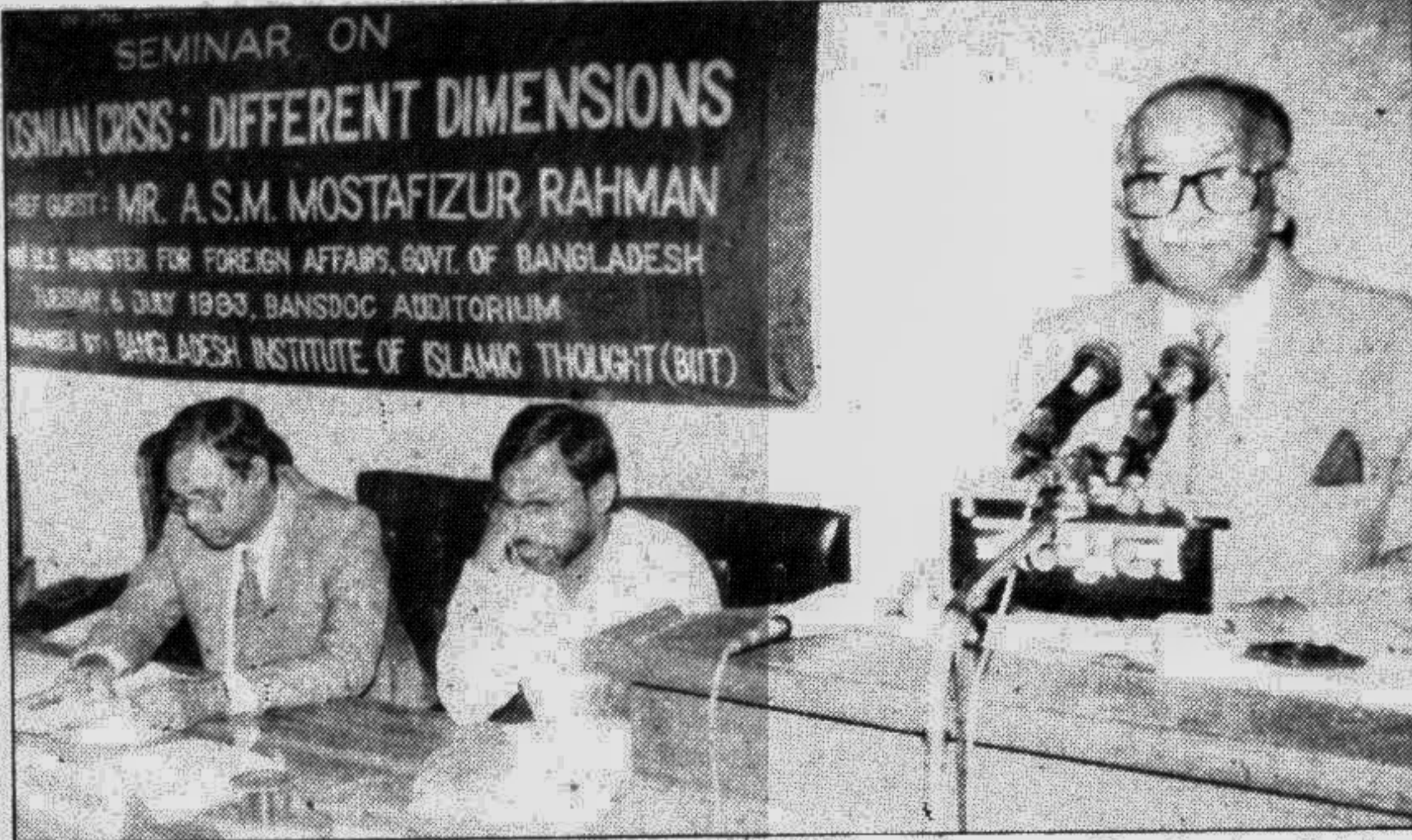
Foreign Minister ASM Mostafizur Rahman addressing a seminar "The Bosnian Crisis: Different Dimensions" at the BANSDOC auditorium in the city yesterday. (Story on page one)