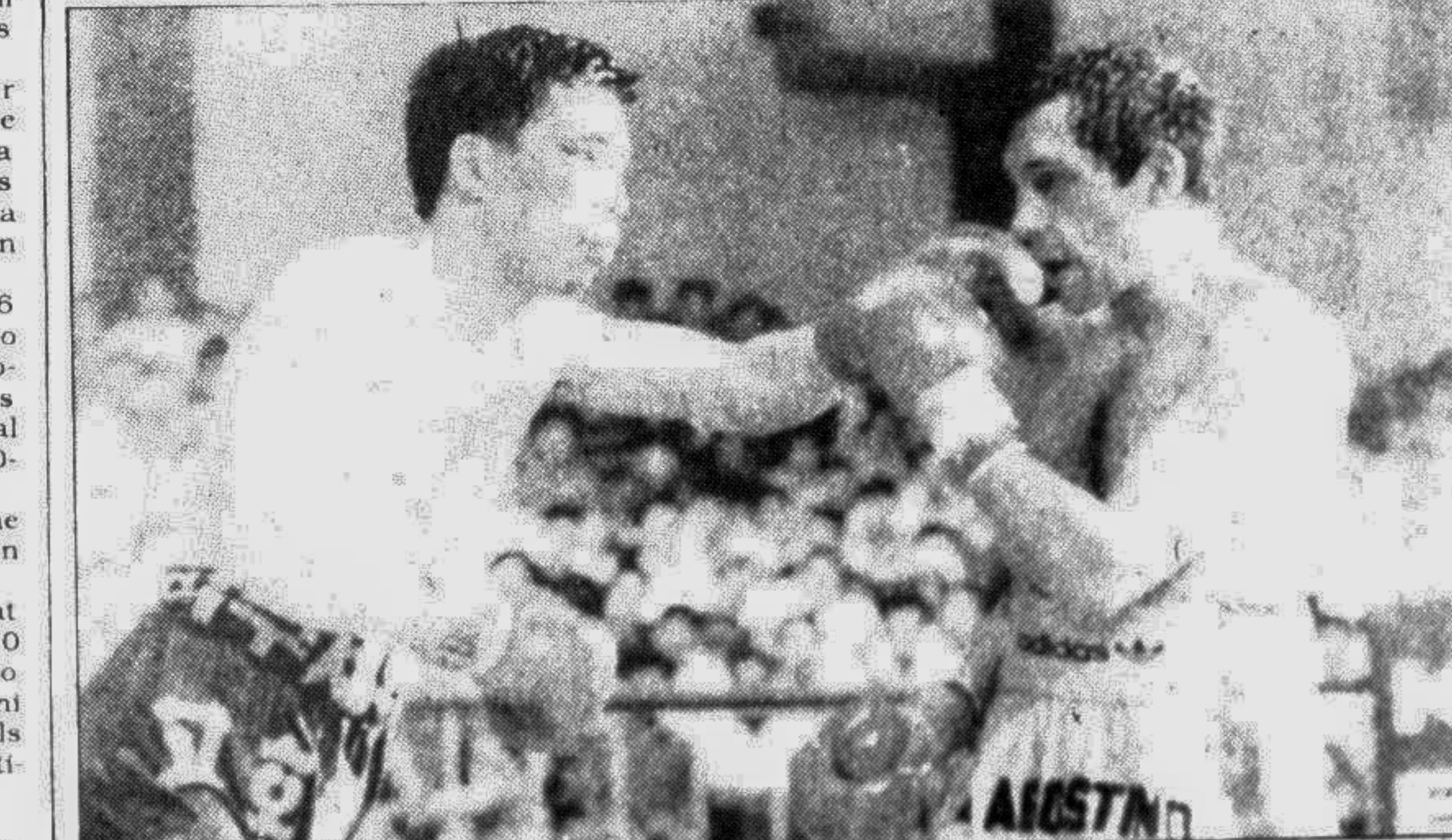
South Korean World Boxing (WBC) super-flyweight Moon Sung-Kil lands a left on his Argentine challenger Carlos Salazar (R) during their title bout in Seoul on July 3. Moon was stretched to his limit by his challenger before finally winning the fight on a split points decision. It was Salazar's fourth defeat at the hands of the Korean champion.

with an entertaining 17 but major honours of the morning went to David Boon who completed his second successive Test century. Boon made 101 after re-summing on 88 but immediately fell to Martin McCague who ended his Test debut with creditable figures of four for 121 from 32.3 overs. Boon faced 177 balls and batted for almost 4-1/2 hours. Border, who went in at number eight because of a bad hay fever attack on Friday, was caught off the bowling of Peter Such for a plucky 38. Unhappy England manager Keith Fletcher said: "Michael Atherton played a poor shot to a ball going down the leg side, while Mark Lathwell and Alec Stewart were both out because of not exactly great batting." But Fletcher felt all was not lost. "We could do with another 200 runs on Monday and then this would be an interesting Test match," he said. "I believe that a target of 270 would take some getting for Australia and even 240 might be too much."