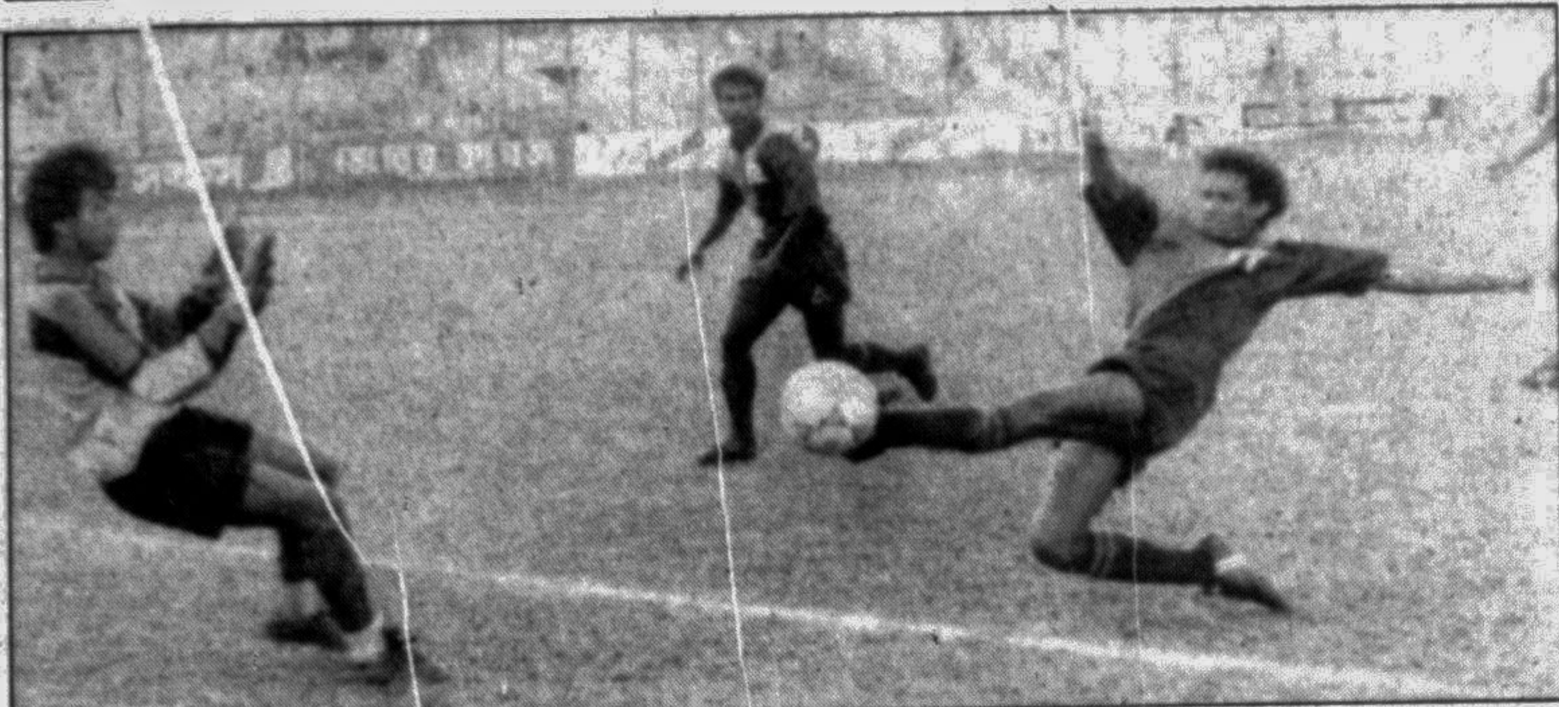
An Adamjee striker stretches in a vain attempt to put the ball into the net past an advancing Bangladesh Boys goalie during yesterday's Star First Division football league match at the Dhaka Stadium. Bangladesh Boys won the match by two goals to one.