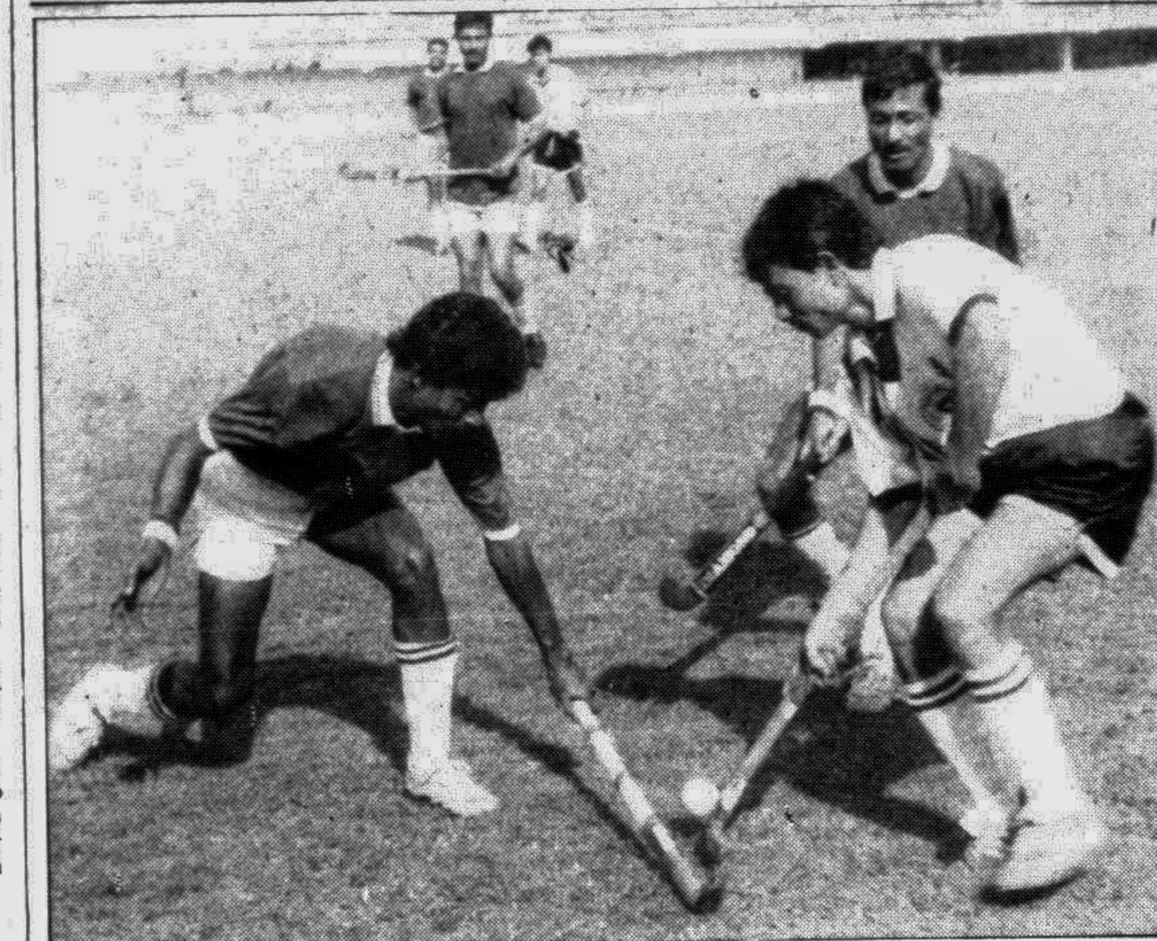
A midfield tangle in the Green Delta First Division hockey league match between Dhaka Wanderers and Police Athletic Club at the Hockey Stadium yesterday. The match ended in a goalless draw.

Youngmen's Fakirerpool Vs Eskaton (4:30) Abahani Vs Agrani Bank (6:30)