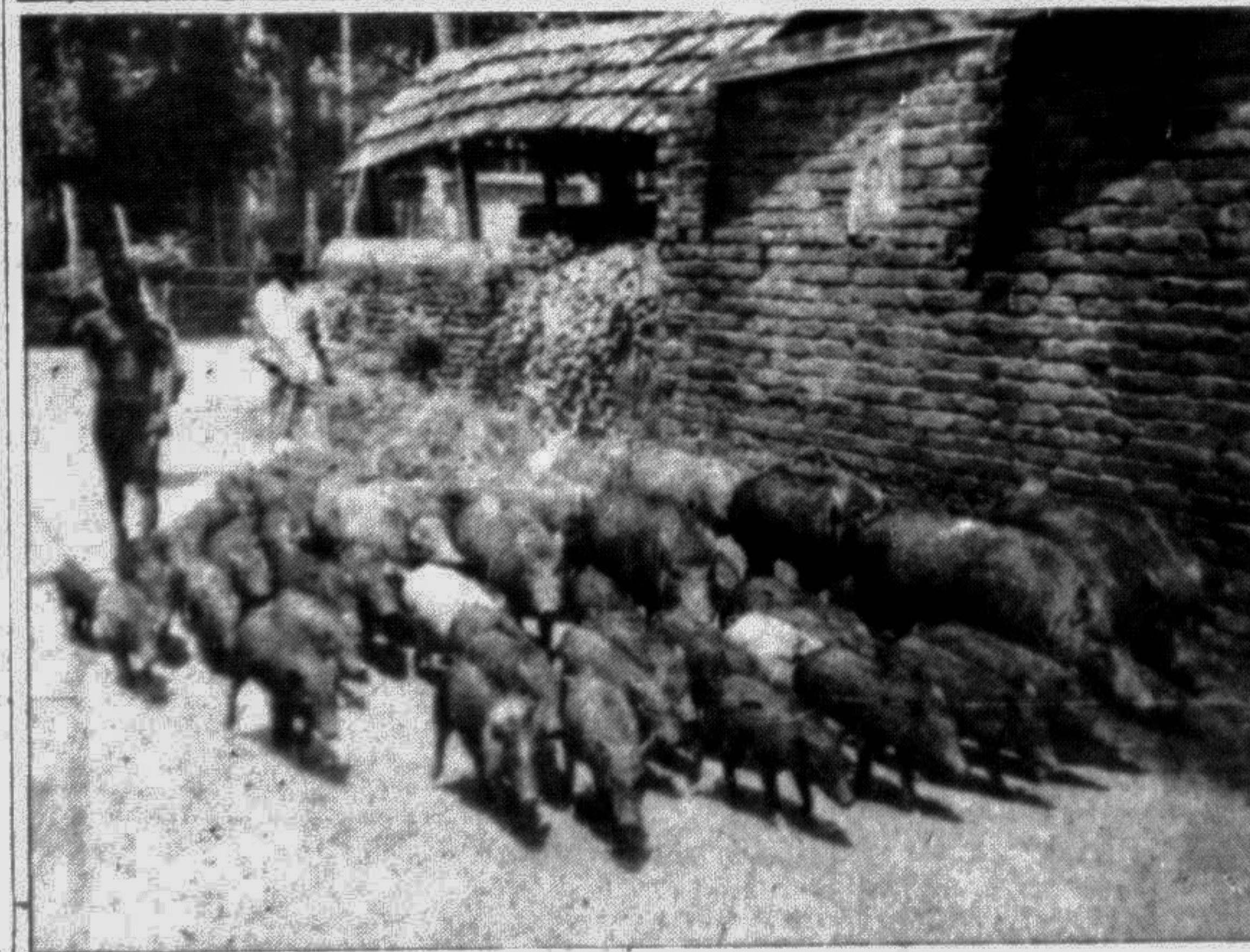
NATORE: Movement of pigs through different streets of the town causes inconveniences to the pedestrians.