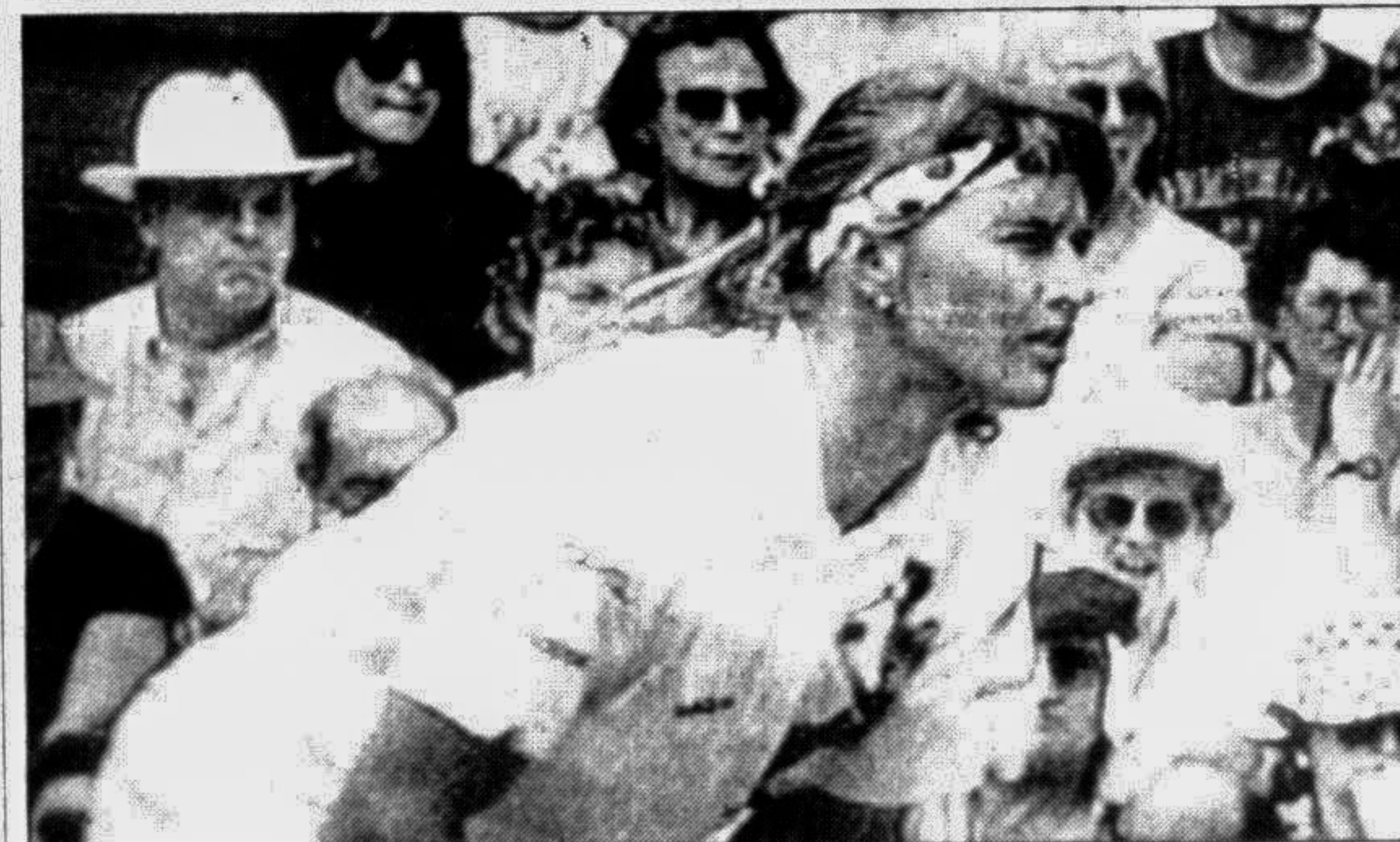
World number one German Steffi Graf awaits Spaniard Conchita Martinez's serve during their Wimbledon women's singles semifinal at the All England Club Thursday. The defending champion rolled into the final with a tougher-than-expected 7-6, 6-3 victory.

She has had a good year so far, winning in Brisbane and Houston before beating Gabriela Sabatini to take the Italian Open title in May.