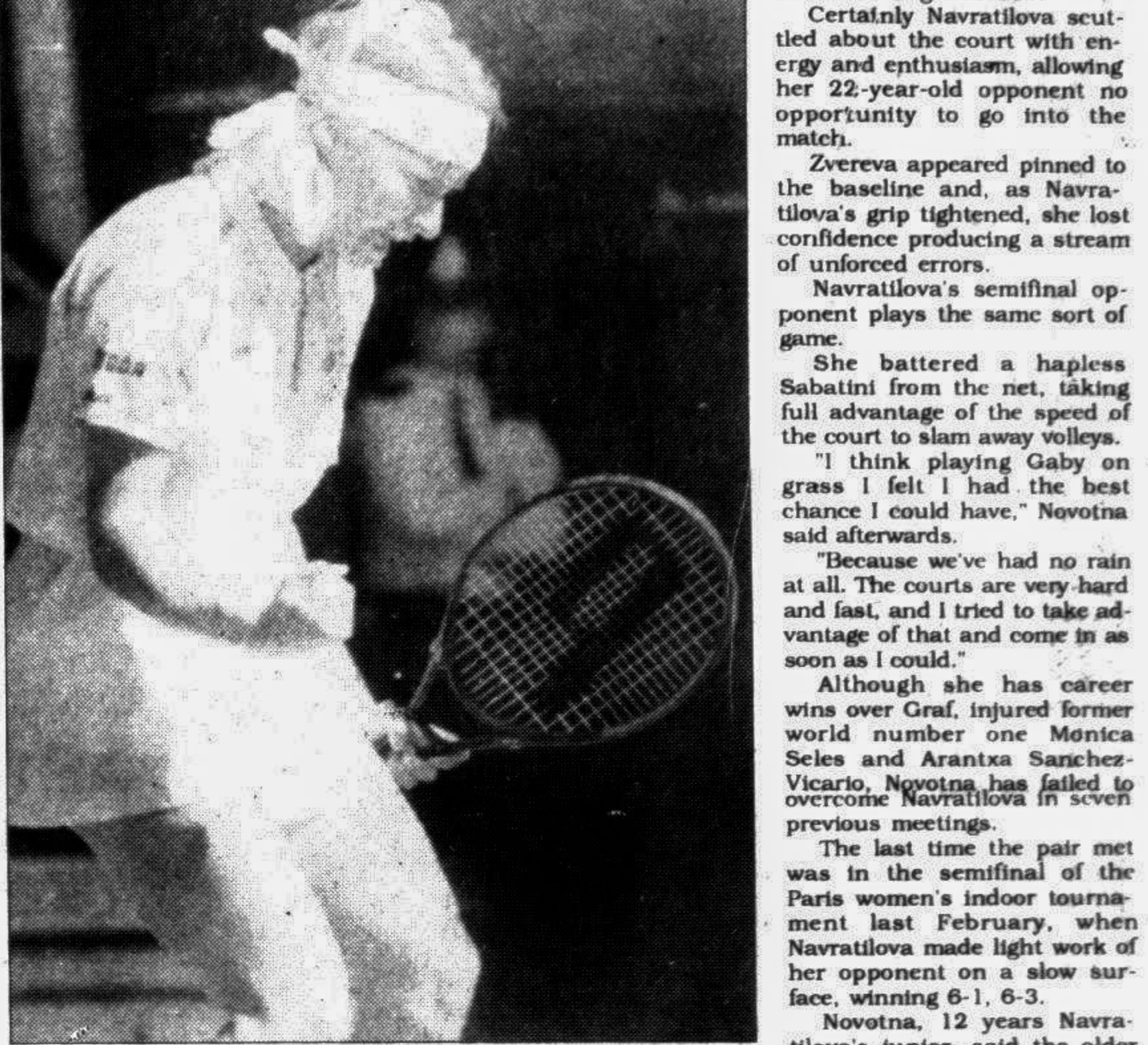
ALL FIRED UP... Jana Novotna of the Czech Republic rejoices after hitting a winner against Argentine Gabriela Sabatini in the women's quarterfinals of the Wimbledon tennis championships on Tuesday. Novotna made it to the last four with a straight sets victory.