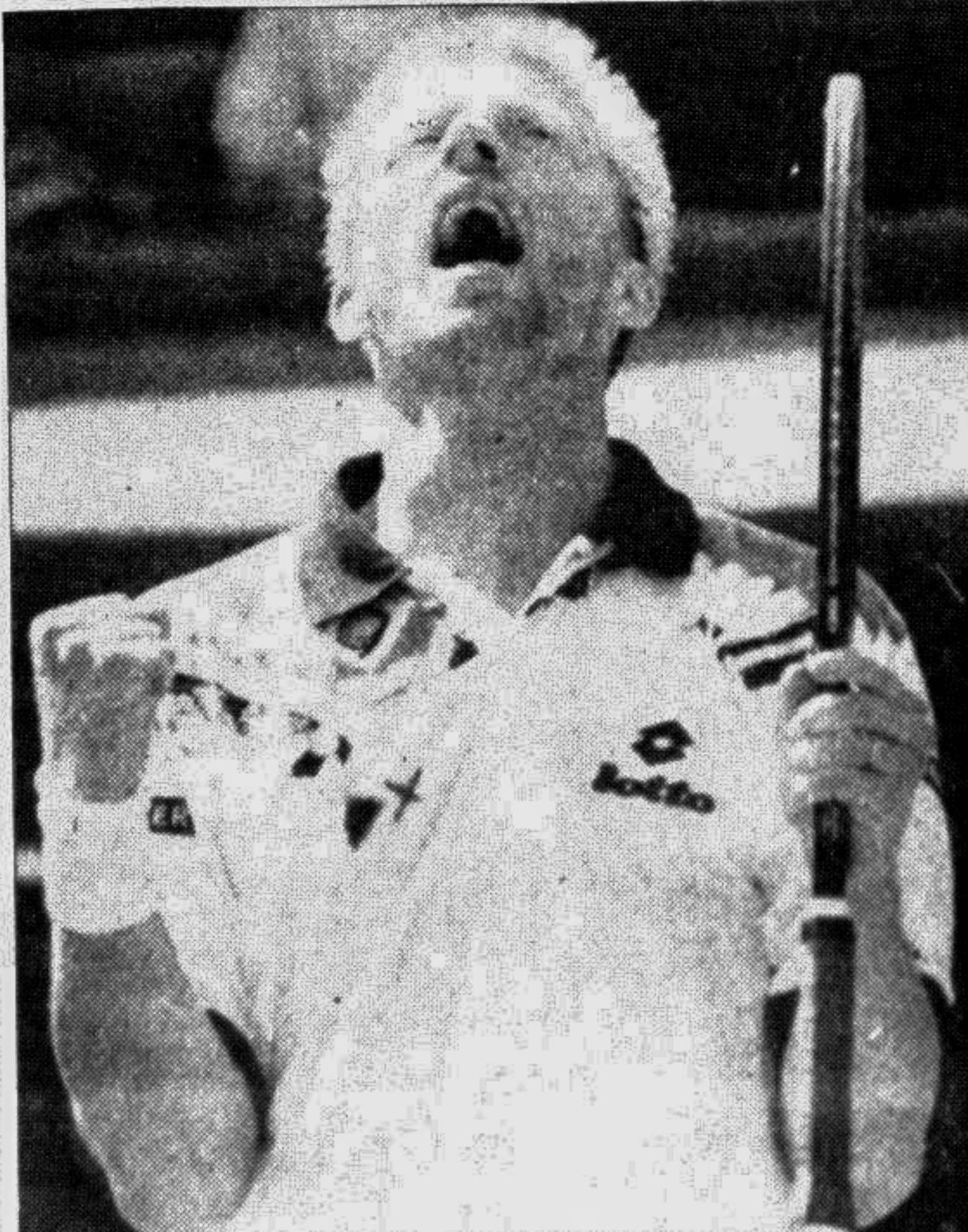
Boris Becker of Germany emits a loud cry of triumph after breaking French crowd-puller Henri Leconte in the fourth set of their fourth round match in the Wimbledon tennis championships on Tuesday. Becker won 6-4, 6-4, 3-6, 6-3 to set up a quarterfinal date with fellow German Michael Stich.