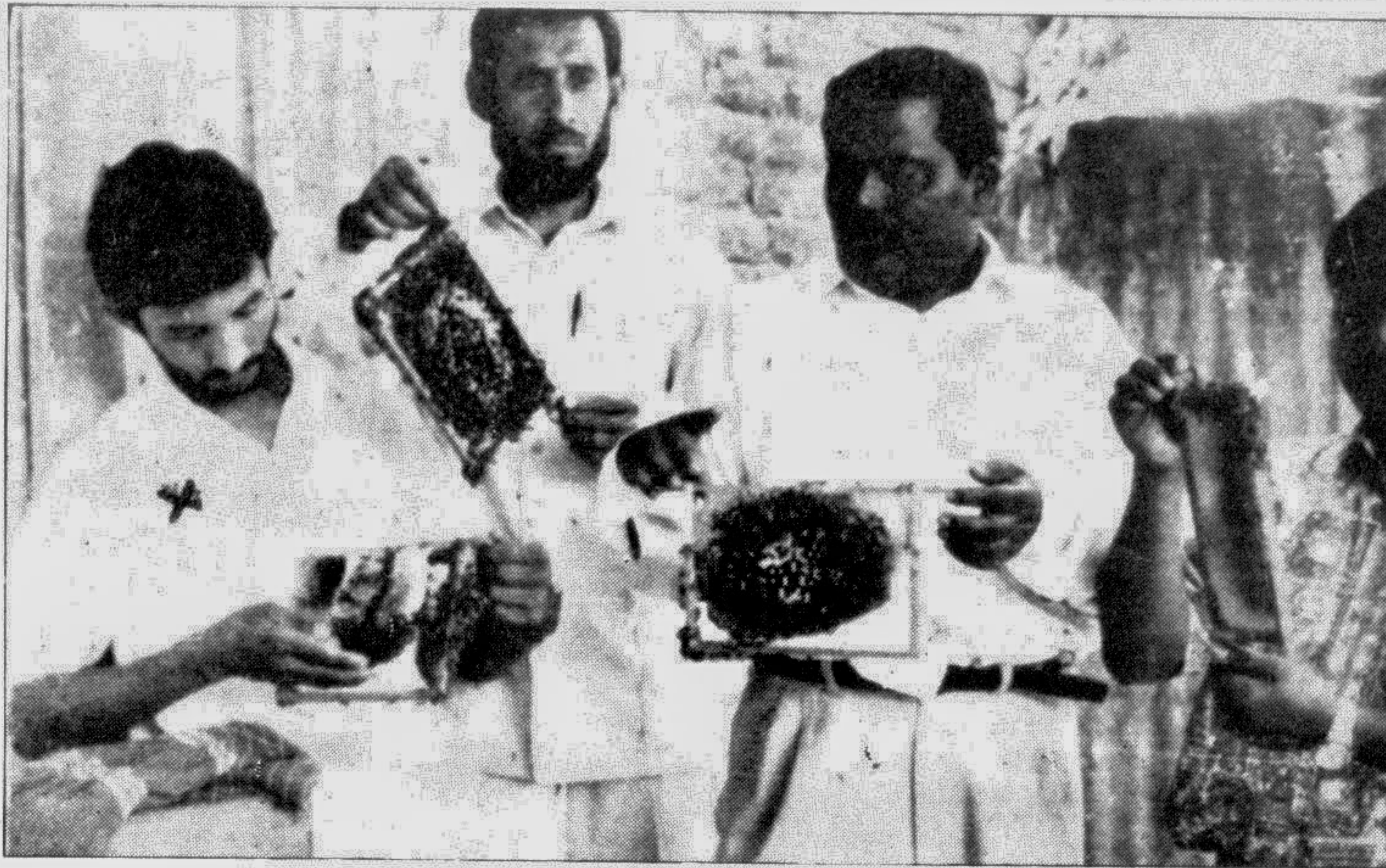
SIRAJGANJ: Bee farming is becoming popular in the district as it can be done in small and large scale. People are seen in the picture with bees (in the plate).

All the doctors in the town shut down their chambers following the attack to avoid any untoward incident, local people said.