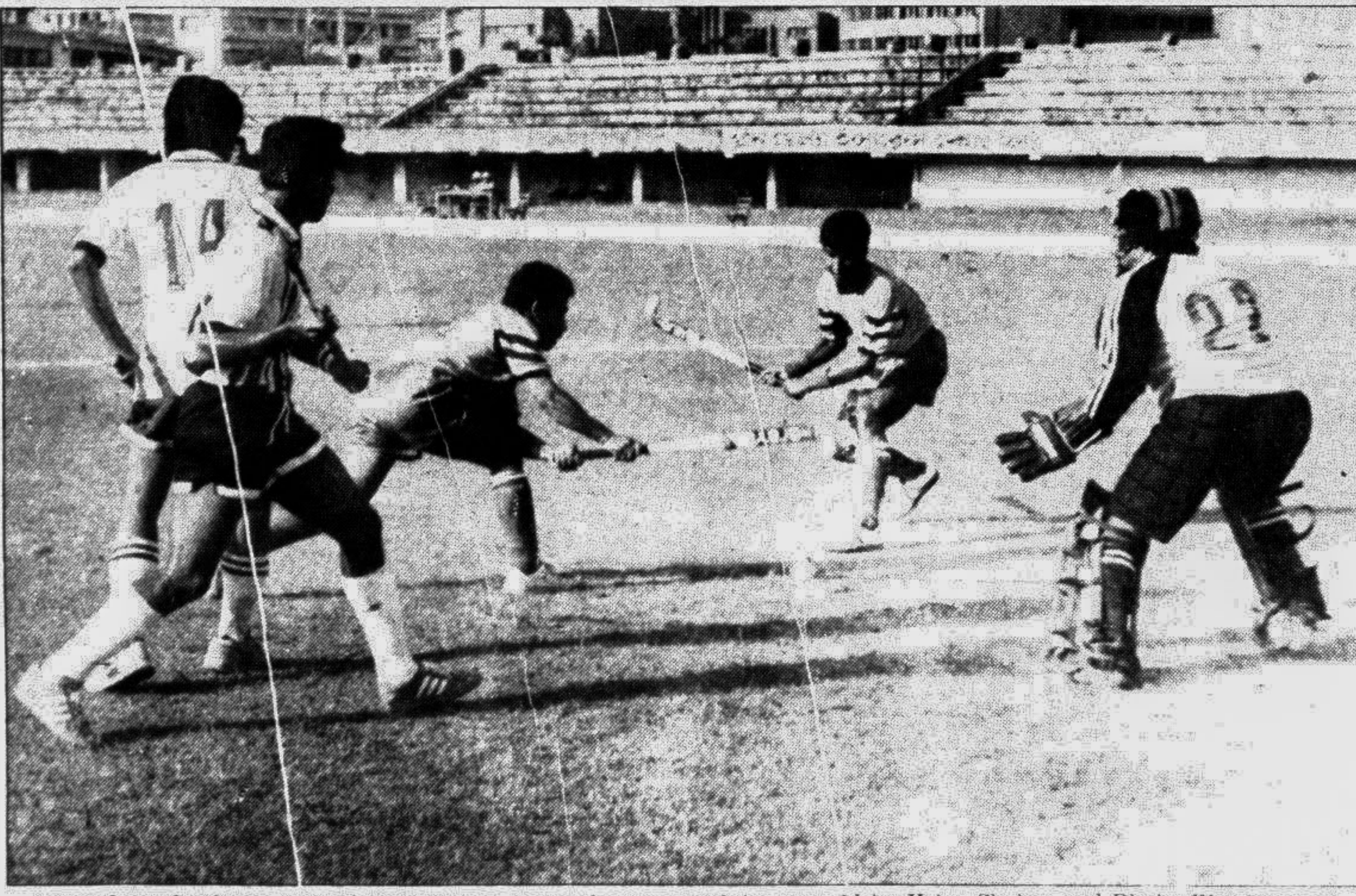
Action from the Green Delta First Division hockey league match between Usha Krira Chakra and Dhaka Wanderers at the Hockey Stadium yesterday. The Independence Cup winners trounced lowly Wanderers 7-1.

Tapie himself was suspended from his official functions for 12 months by the French Soccer Federation in 1991 for trying to intimidate referees.