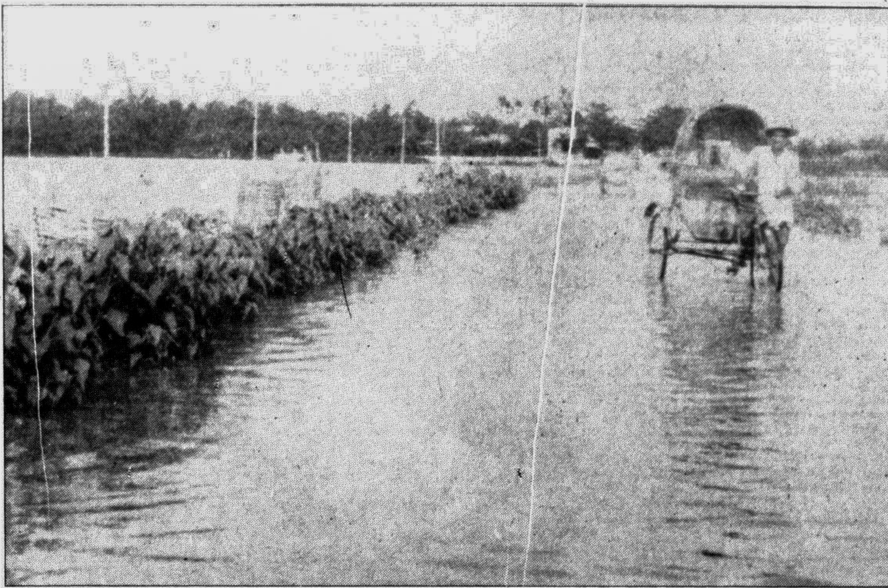
MAULVIBAZAR: The Shamsernagar Foad near Simultala bazar of the flood-hit district is still under knee-deep water.

The victim was allegedly associated with different terrorists activities and a member of outlawed parties.