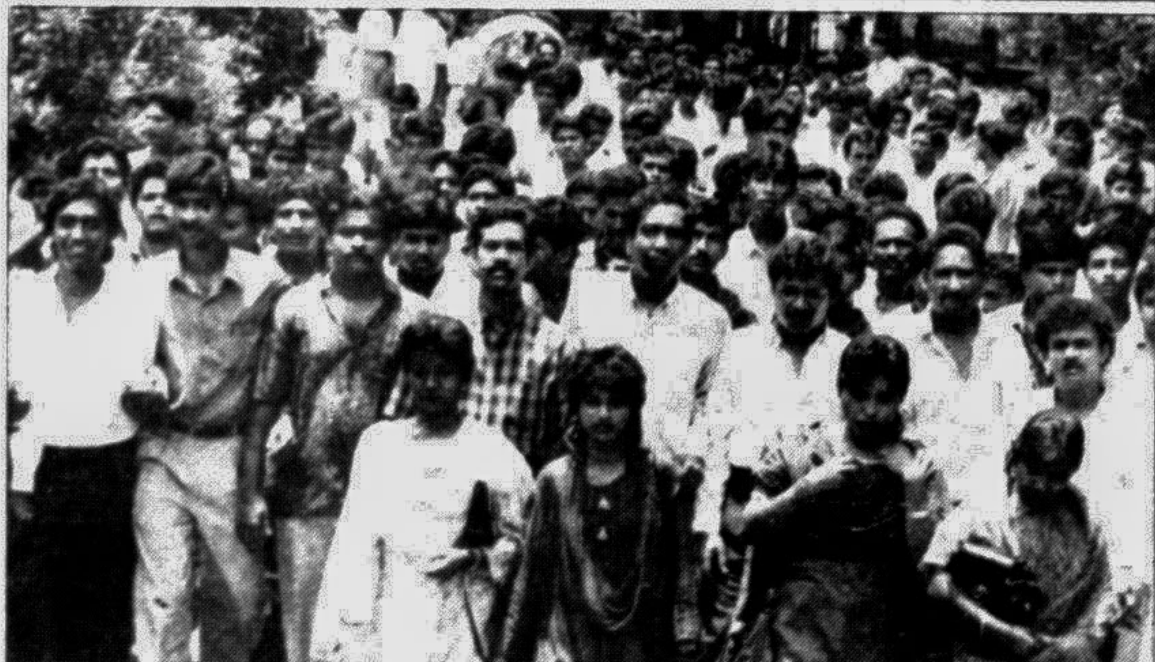
JCD brought out a procession on DU campus yesterday demanding a violence free campus.

The certificates have been conferred by the University of Chittagong upon the midshipmen, who attended Bachelor of Science Degree curricula conducted by the Academy side by side with military training.