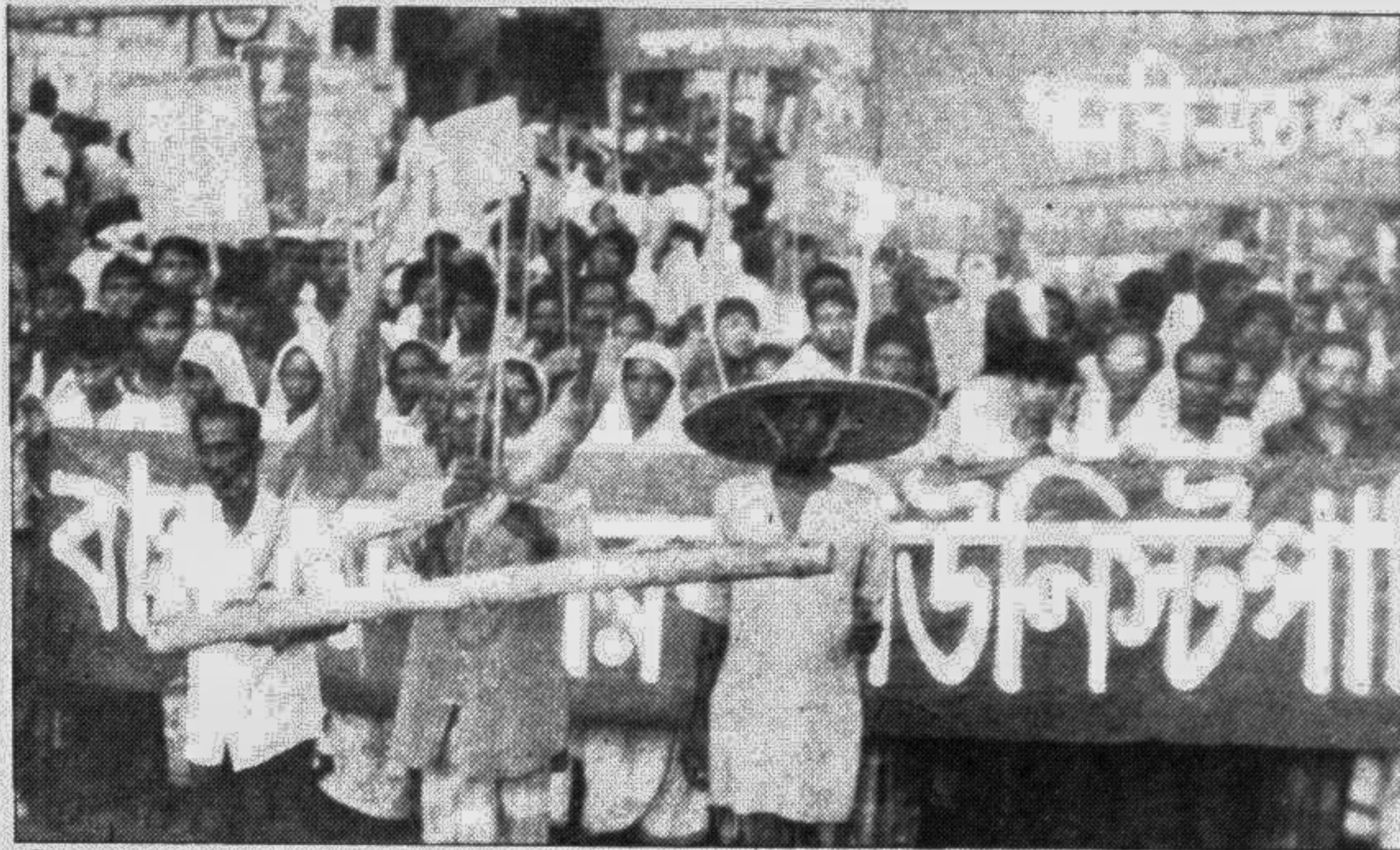
Bangladesher Communist Party (Selim) brought out a procession in the city yesterday demanding subsidy on agricultural inputs.