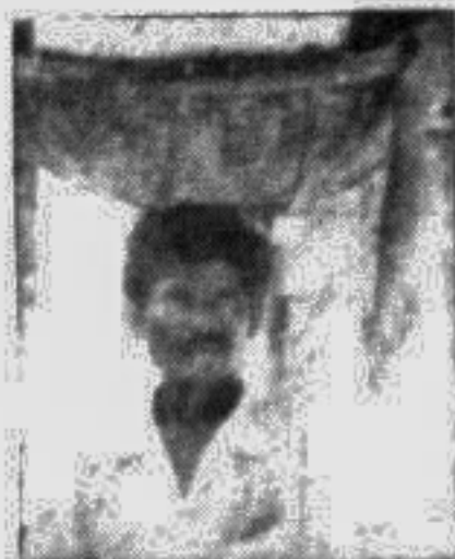
When Greek Meets Greek Page 3