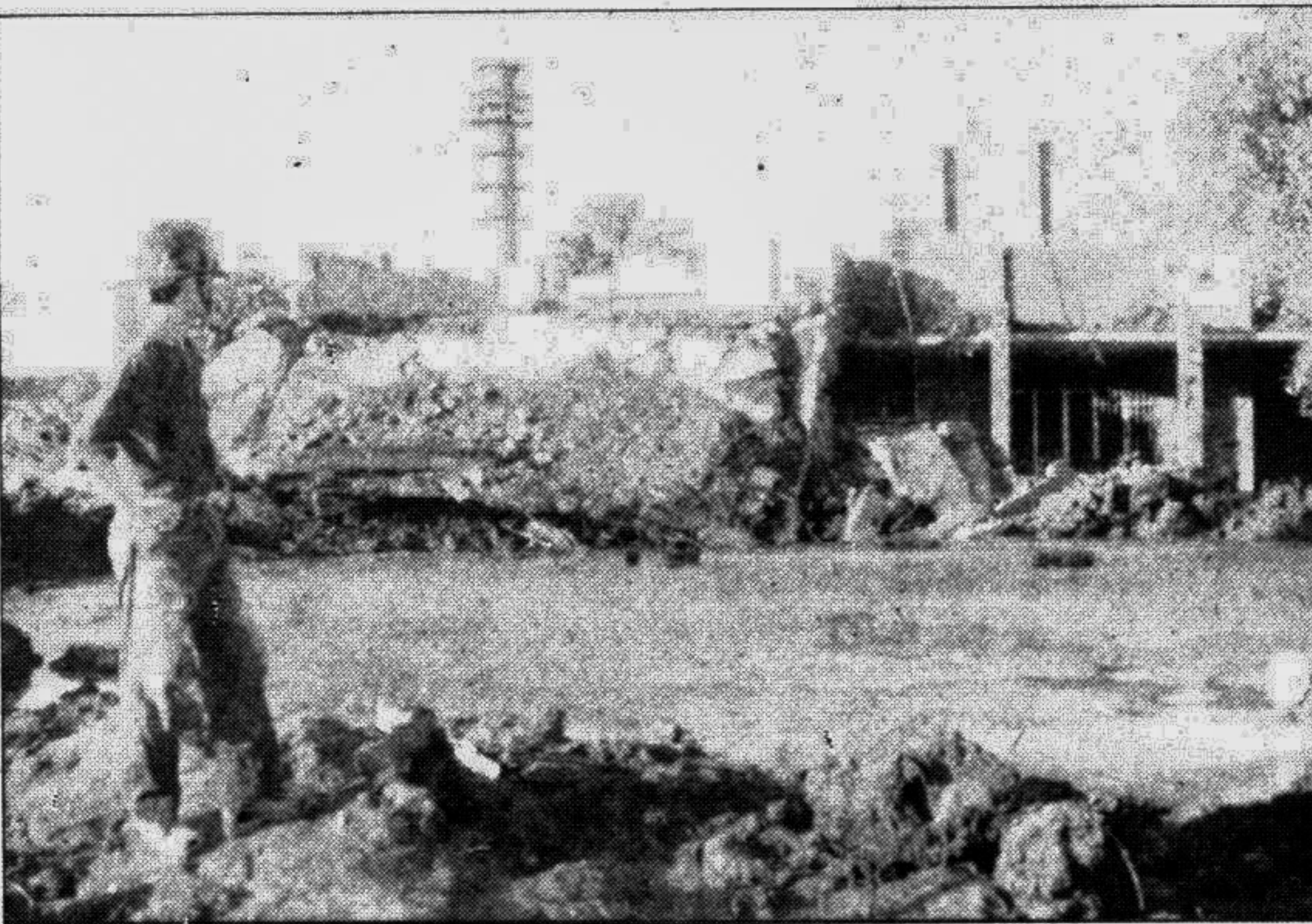
An Iraqi rescue worker surveys yesterday damage from the US attack on the headquarters of the Iraqi Intelligence Service (unseen, about 200 metres away) in the Al-Monsour neighbourhood in Baghdad.

BAGHDAD, June 27: US warships fired 23 cruise missiles at Iraqi intelligence headquarters in Baghdad early today in retaliation for an alleged plot by Iraq to assassinate its Gulf war enemy, former President George Bush, reports Reuter.