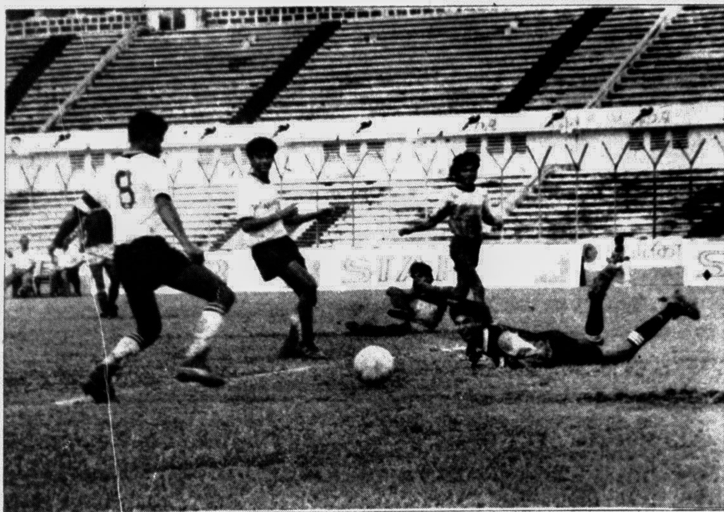
A goalmouth scramble during yesterday's Star Premier Division football league match between Arambagh Krira Sangstha and Rahmatganj Muslim Friends Society at the Dhaka Stadium. The match ended in a goalless draw.