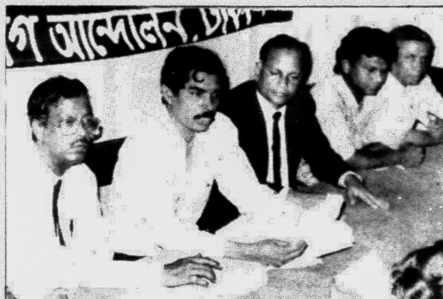
The Movement for Implementation of Sylhet Division held a press conference at the National Press Club yesterday.

The speakers called upon all section of the society to work unitedly against drug abuse. Related story on page 1