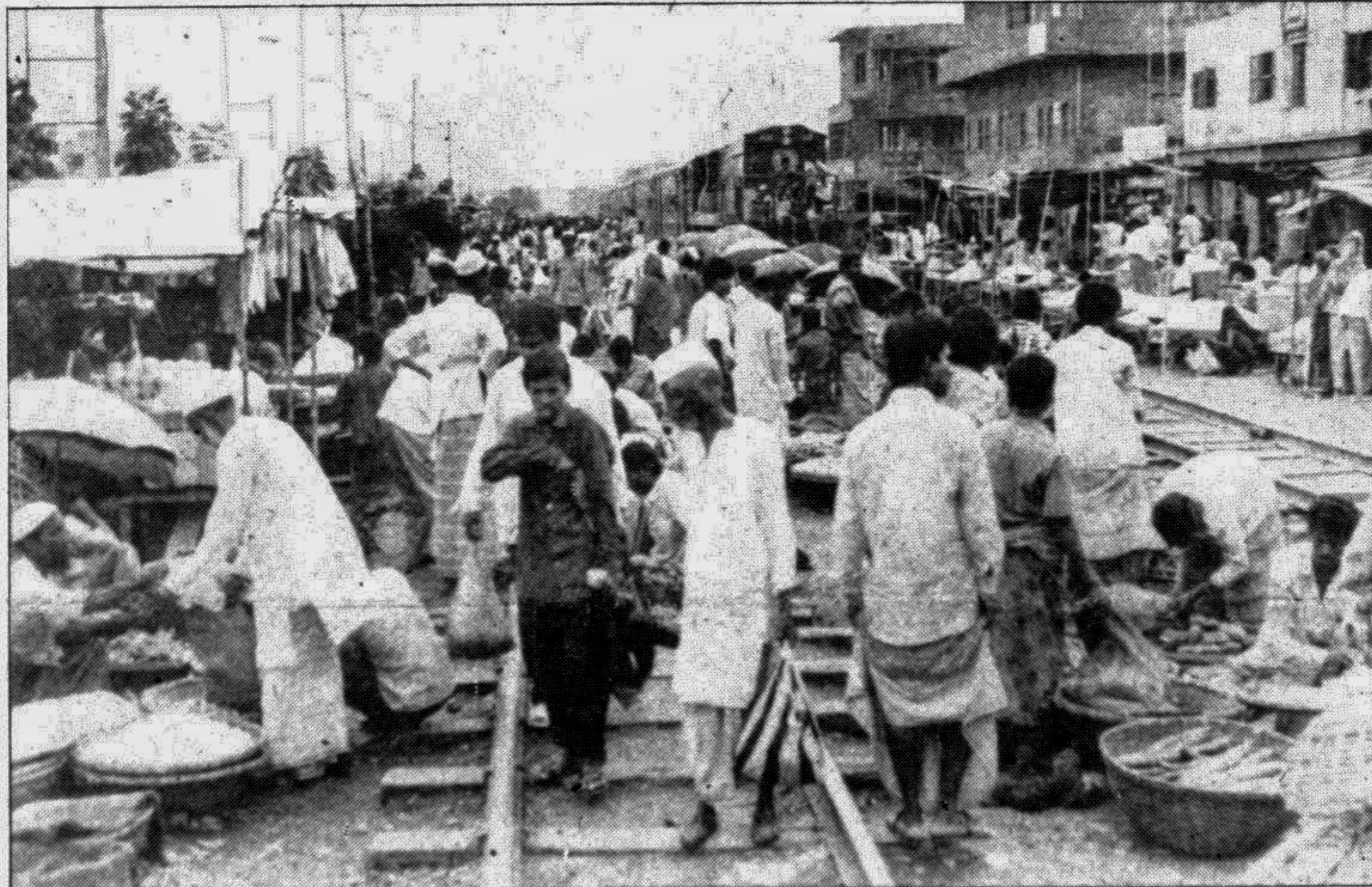
A MOST UNLIKELY MARKET-PLACE: The Rampura level-crossing in the city doubles as a market for daily necessities and should someone fall under the wheels of an approaching train, it is considered sheer misfortune for the victim.

Prime Minister Begum Khaleda Zia yesterday stressed the need for effectively involv- ing the 'target group' among the rural people, which consti- tutes 80 per cent of the popu- lation, with the family planning programmes to contain the population boom, reports BSS. She also urged the country's political parties to give priority to the population problem in this party agenda. The Prime Minister was addressing the first meeting of the reconstituted National Population Council, the highest policy formulating body, at the International Conference Centre (ICC) last night. Begum Zia said the concept of the planned family had not yet fully reached the target group, which really needs the family planning. The Prime Minister, who is the chairperson of the National Population Council, said it is a matter of concern that the rate of population growth is 2.03 See Page 12 Col 7