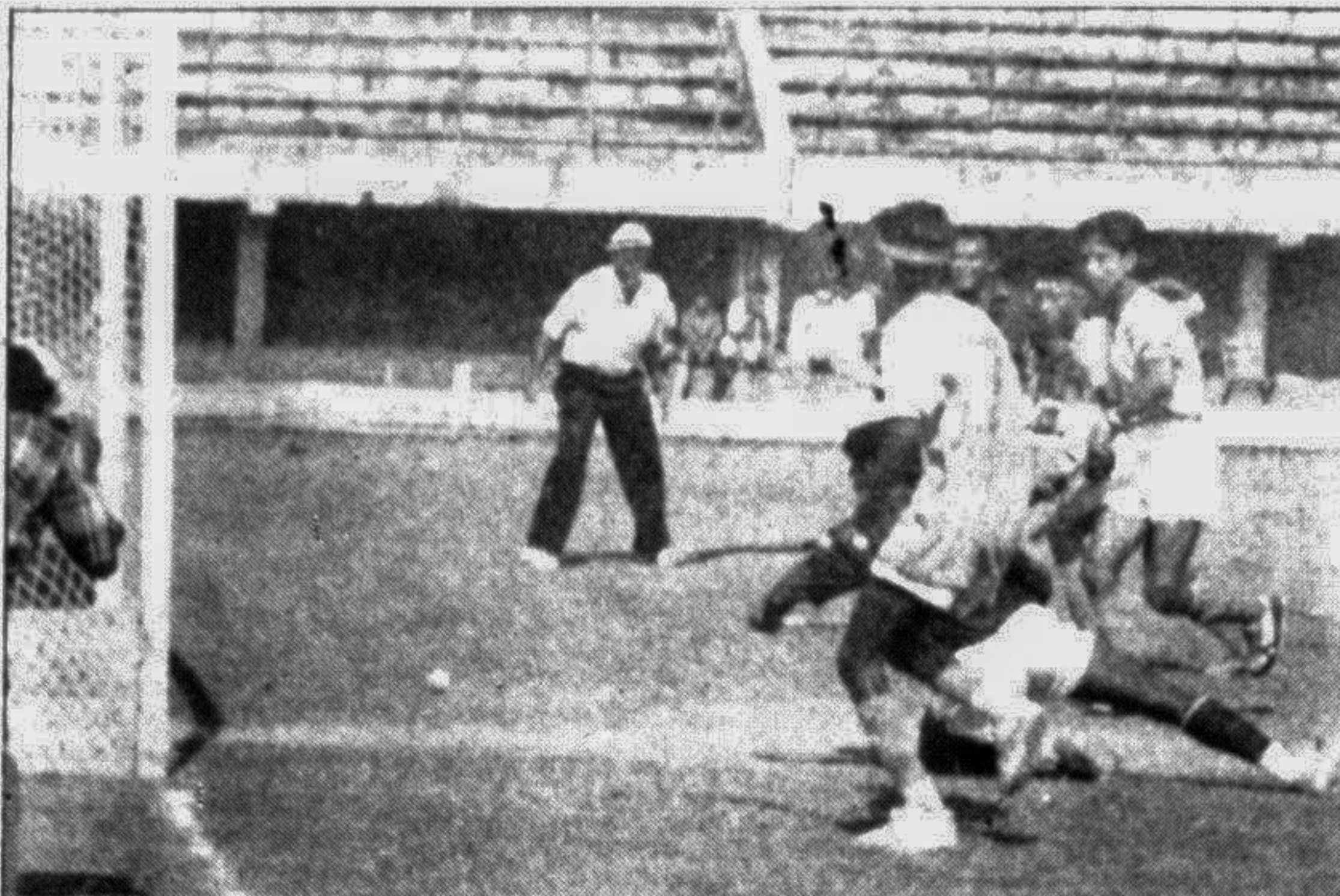
Action from yesterday's Green Delta First Division hockey league encounter between Sonali Bank and Public Works Department (PWD) at the Hockey Stadium. The bankers won the match by a solitary goal.