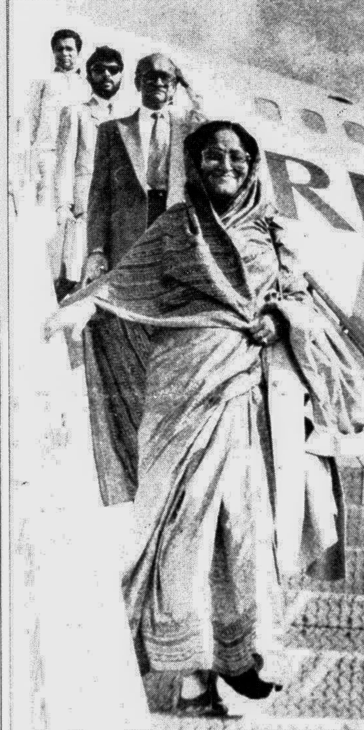
Awami League chief Sheikh Hasina returned home yesterday after attending the World Conference on Human Rights in Vienna. Foreign Minister Mostafizur Rahman also returned by the same flight.

two Jamalpur constituencies. One of the youngest MPs, Azam alleged that former State Minister for Establishment Mohammad Nurul Huda was fired for corruption but there has been no action yet against another Minister against whom specific charges of irregularities and nepotism were brought. Azam, in his allegations, said that the LGRD Minister had given a construction work worth Taka two crore in Jamalpur to one of his nephews without any tender in exchange of a 10 per cent commission. The minister had given another 50 lakh taka work to his nephew bypassing the tender. A relative of the LGRD See Page 12 Col 3