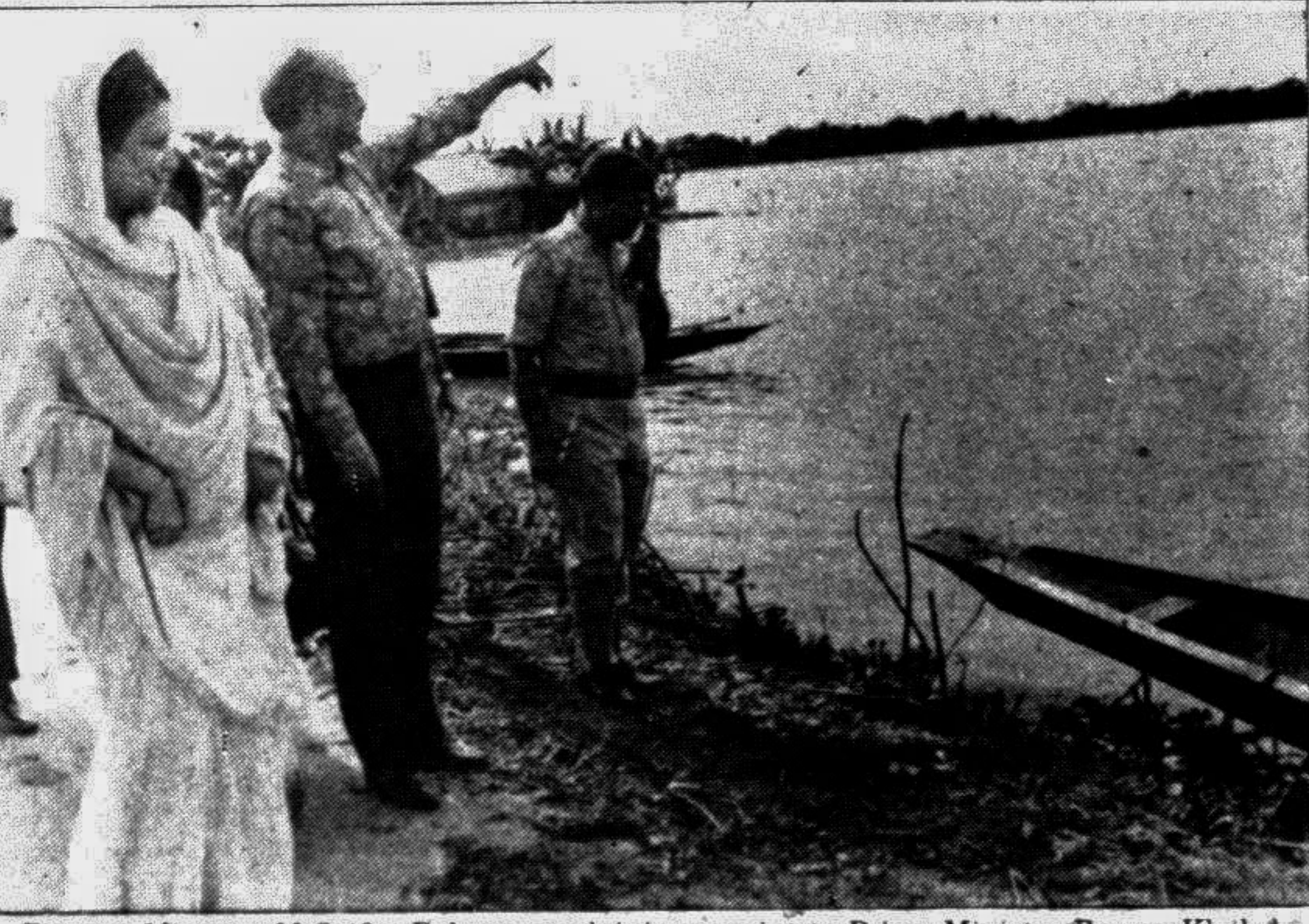
Finance Minister M Saifur Rahman explaining a point to Prime Minister Begum Khaleda Zia during their visit to the flood affected areas in Sylhet, Moulvibazar and Habiganj yesterday.

discussion Wednesday and today in Geneva, and urged the Vance-Owen peace plan be applied. Talks on dividing Bosnia-Herzegovina into tiny ethnic states linked in a loose confederation resumed in Geneva Thursday amid reports of intensified fighting on the ground. European Community mediator Lord Owen expressed disappointment during the first day of talks Wednesday - boycotted by Bosnian president Alija Izetbegovic - at the "vagueness" of the proposed borders, and added that he and UN mediator Thorvald Stoltenberg "didn't like" some of the proposals they had heard.