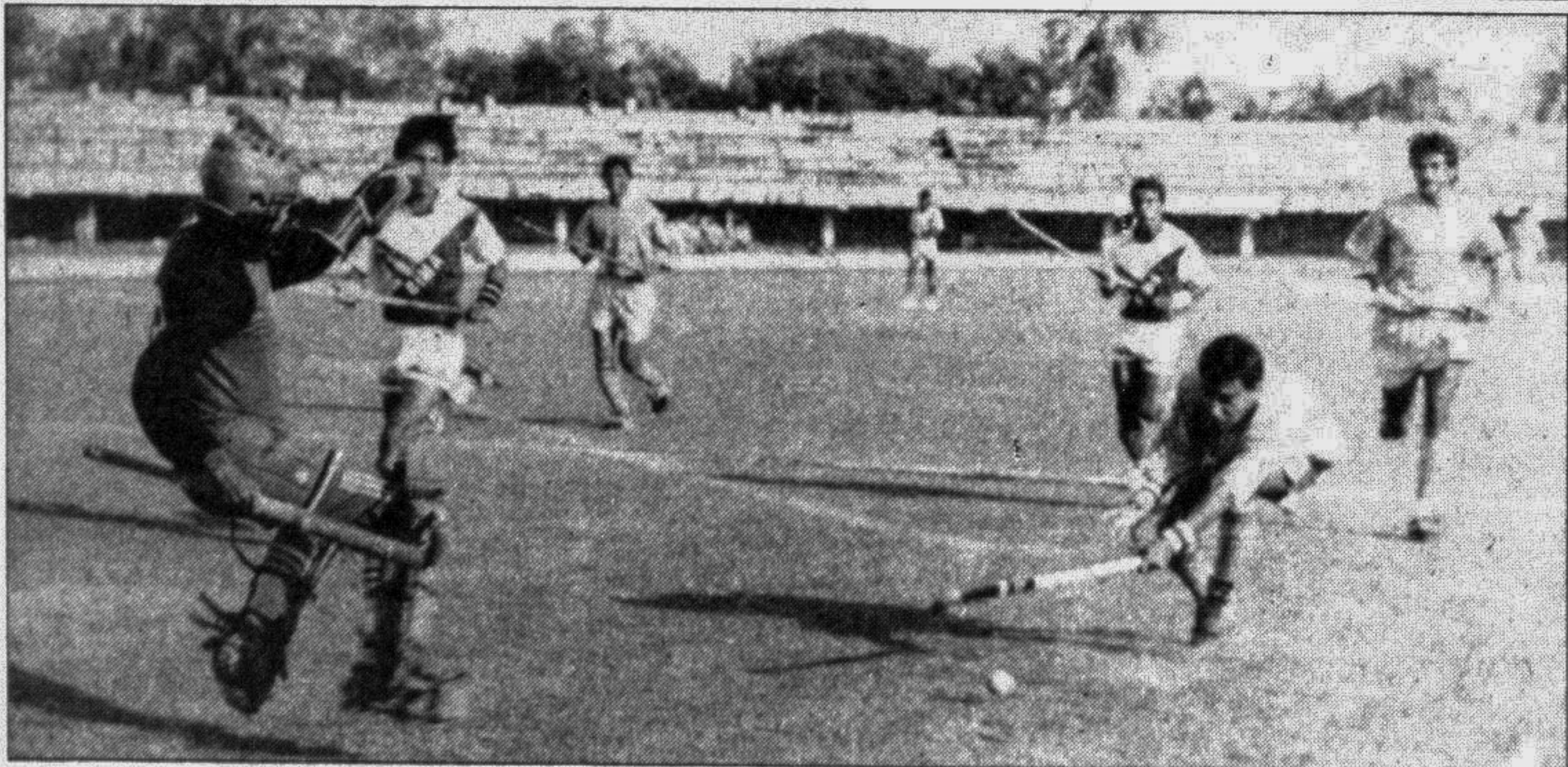
An Abahani forward tries to get hold of the ball inside the Bima D during yesterday's Green Delta First Division league match at the Hockey Stadium. Abahani maintained their all-win record with sweaty 1-0 win.