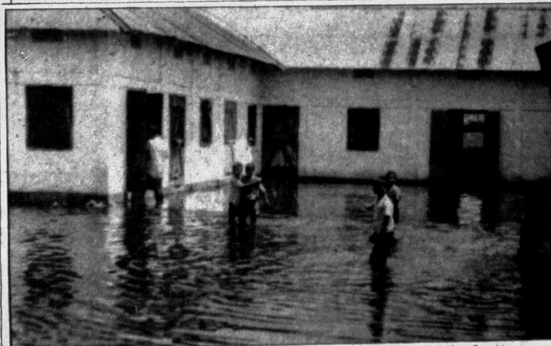
SYLHET: Mendibag Government Primary School of Sylhet hit by the flood waters.

This constant erosion may see the godowns, offices and the staff quarters to landless area if necessary steps are not taken in this respect.