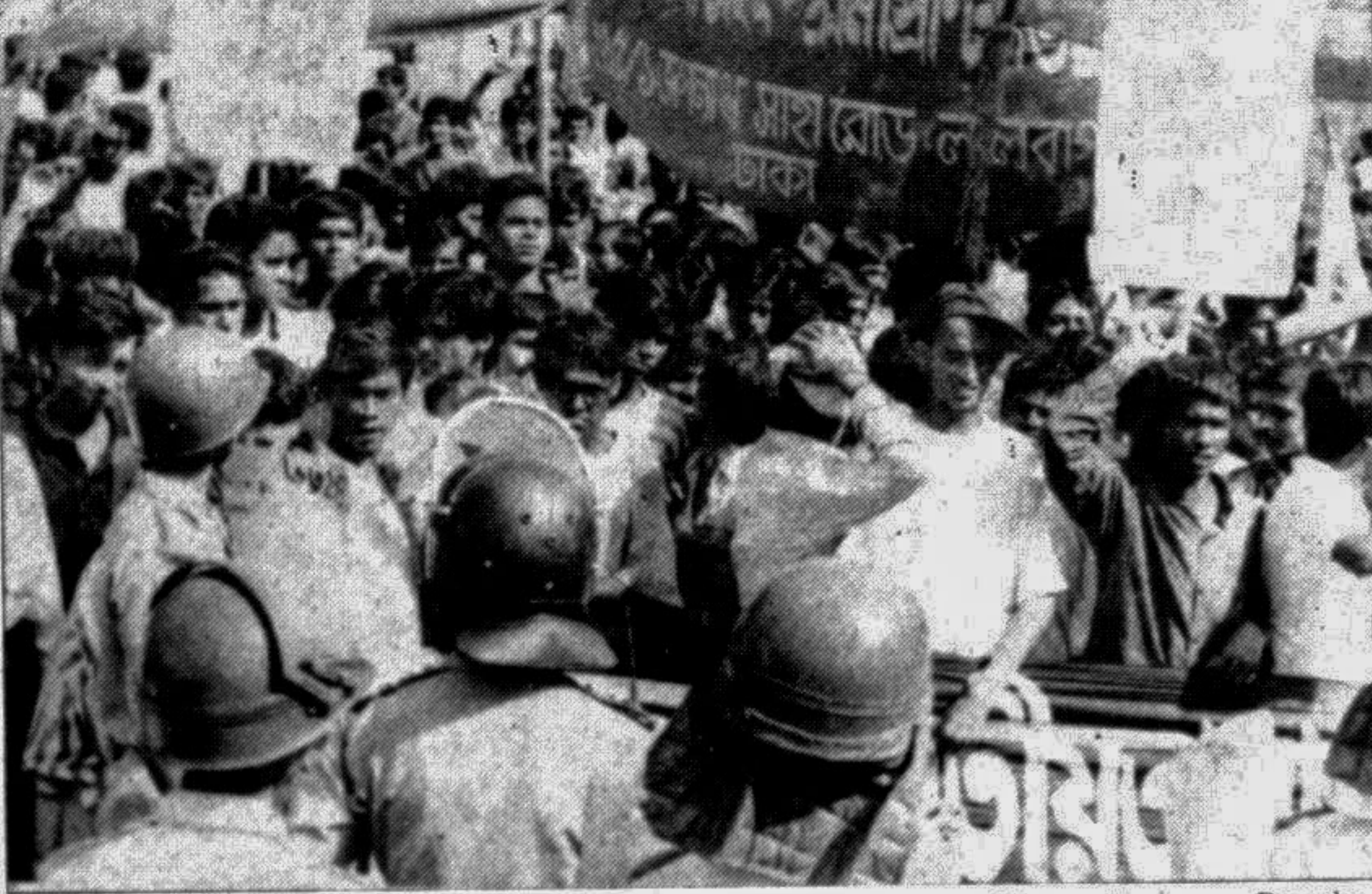
Bangladesh Textile Industries Federation procession intercepted by police near Bangla Motor in the city yesterday.