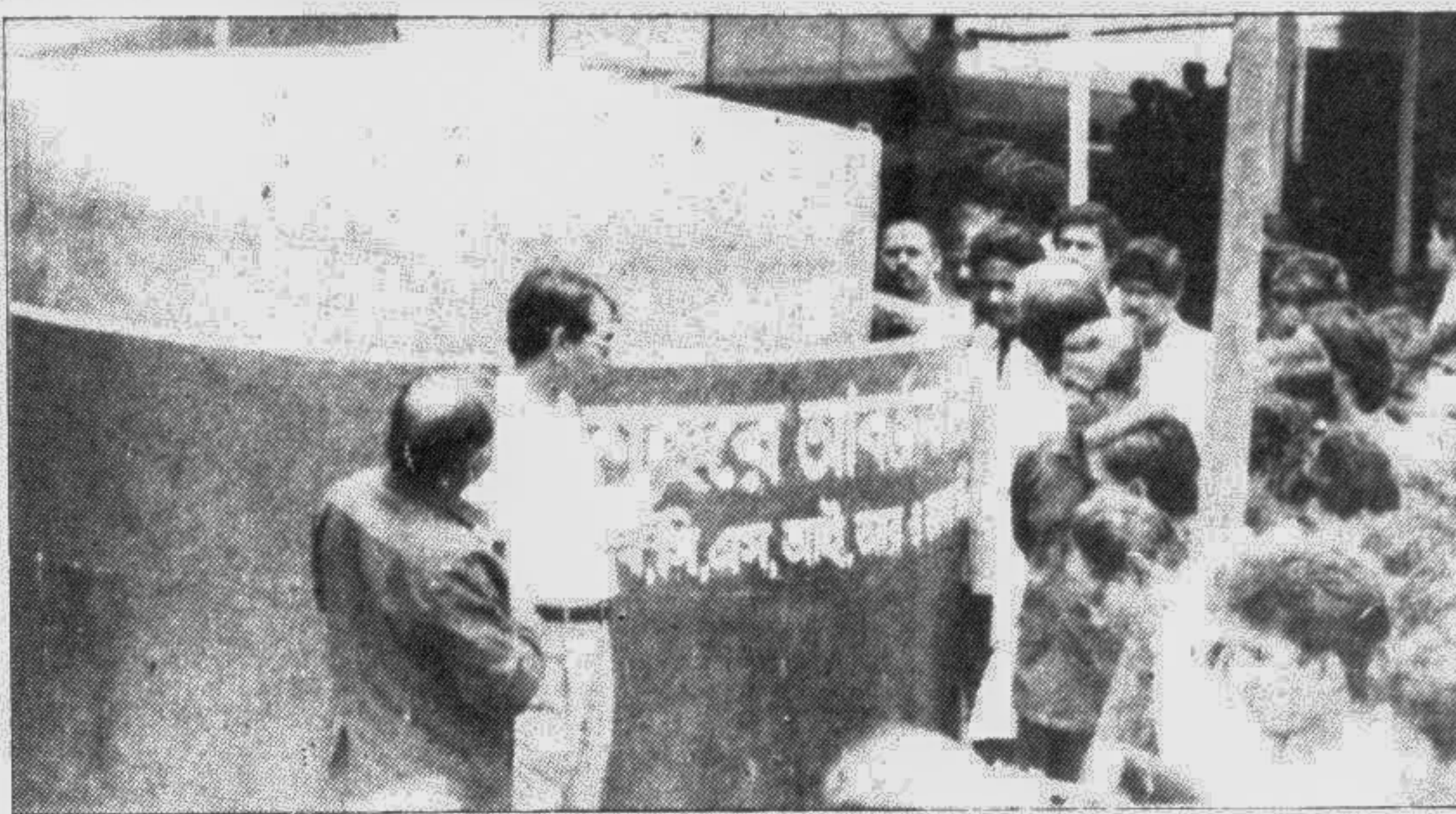
Education Minister Jamairuddin Sircar inaugurated a city garbage based Pilot Biogas Project near Syedabad bus terminal yesterday. The project is jointly organised by Bangladesh Council of Scientific and Industrial Research (BCSIR) and Dhaka City Corporation. DCC Mayor Mirza Abbas is also seen.