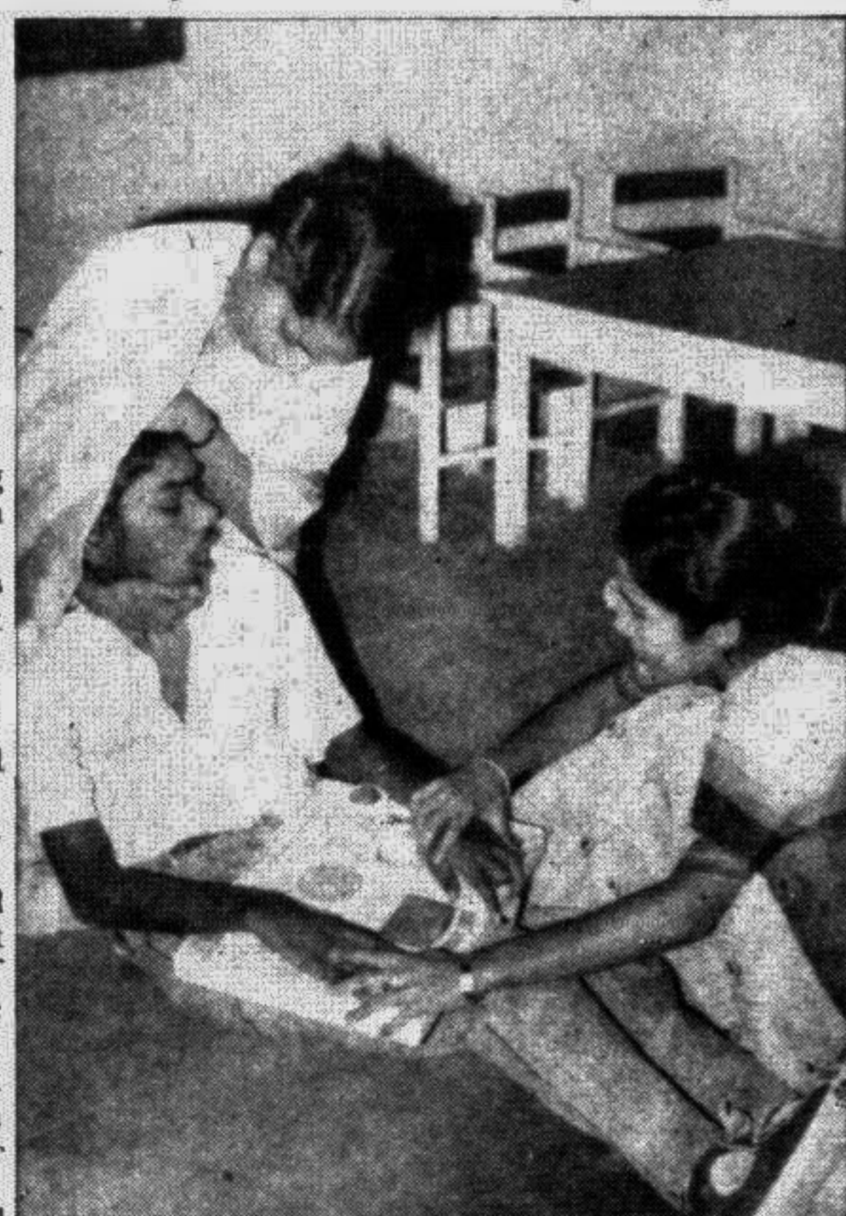
Teaching the mentally retarded.

The participation of such children should be definitely encouraged, more work and facilities should be provided for them. They are already deprived but they make an effort to beautify society, at least in such noble efforts they are superior to the drug addicts who are self-made retardards.