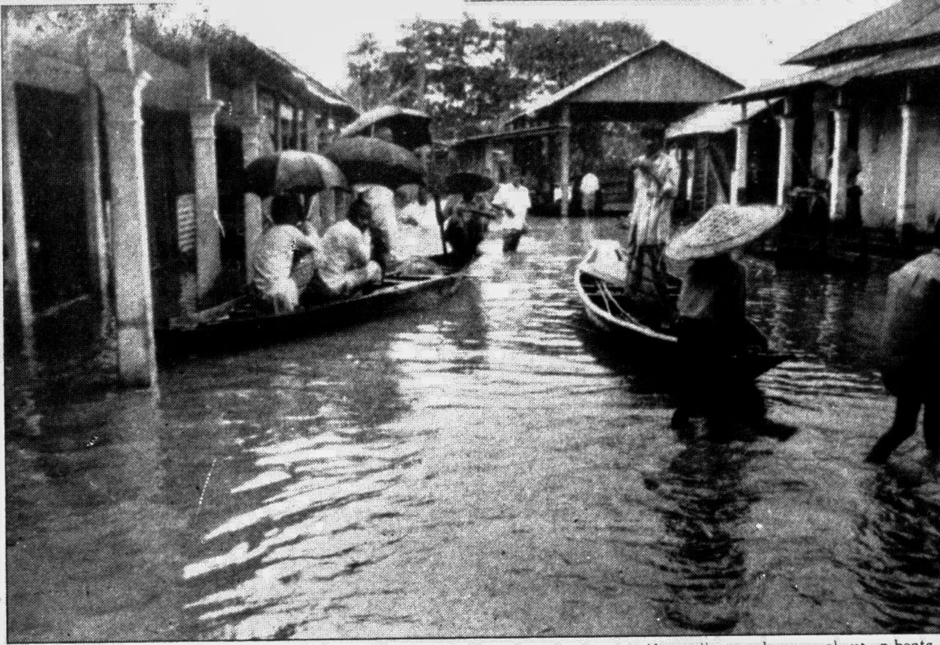
SYLHET: The Boaljur Bazar area of Balaganj Thana under knee-deep flood water. Naturally, people move about on boats

June 21: Four goat rearing farms will be set up at a cost of about Tk 8.20 crore in four divisions of the country during the current year, official sources said, reports UNB. The farms will be set up at Rajbarhat in Godagari thana of Rajshahi, Chuadanga in Khulna, Sevar in Dhaka and Tilagar in Sylhet in Chittagong division. According to Livestock Department sources, the farms will be set up to produce high breed goats and improve the socio-economic condition of rural people.