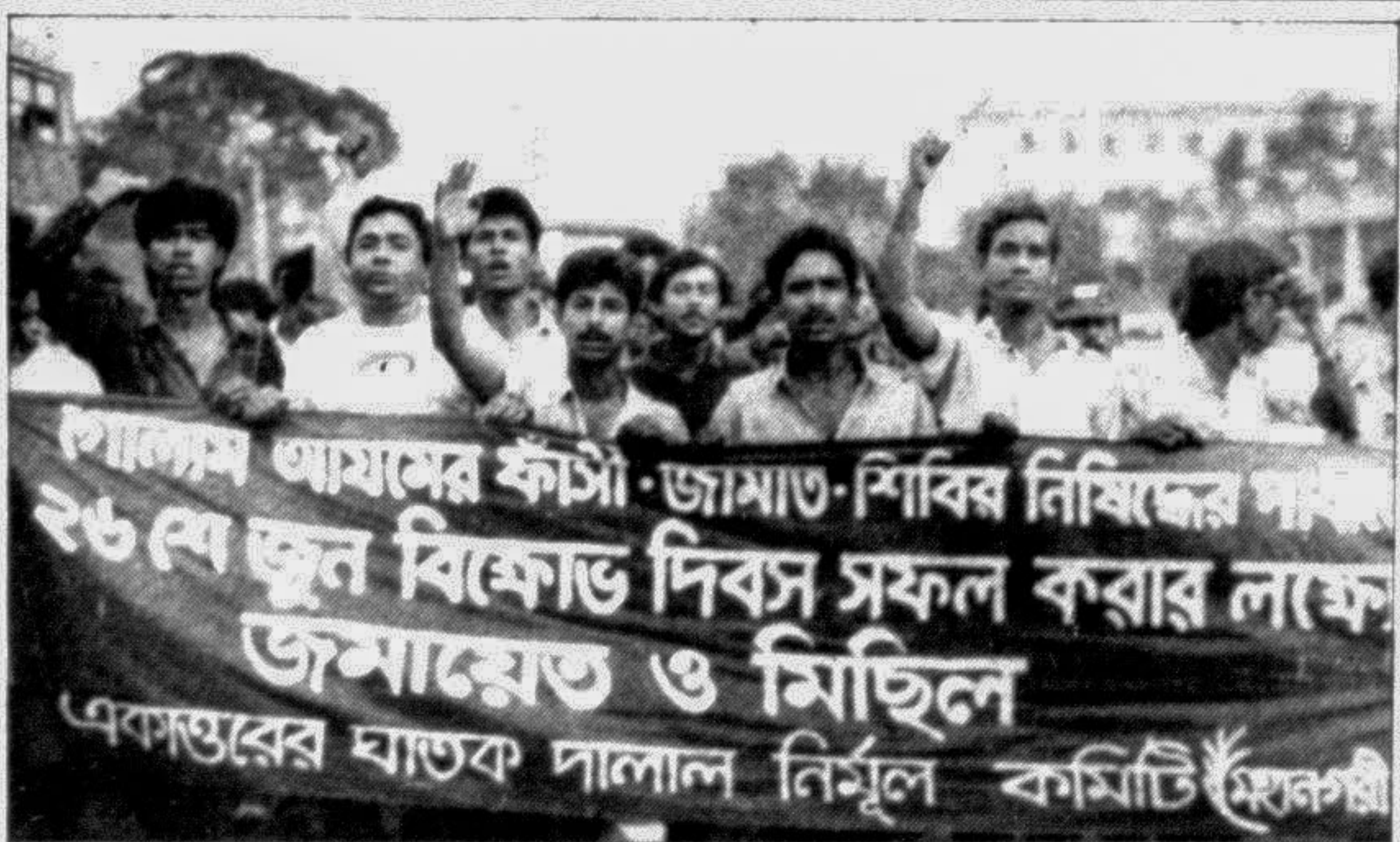
Ghatak-Dalal Nirmul Committee procession in the city yesterday demanding execution of the verdict of 'People's Court' on Golam Azam.