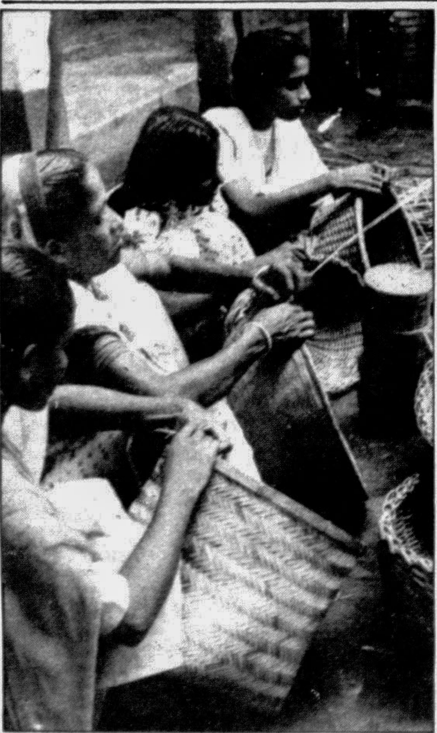
COMILLA: These women are busy making different sizes of baskets for marketing.

Any one having any objection to the above proposal may raise the same to the Registrar (P.O.M.M.D) Chittagong, within 7 (Seven) days from the Publication of the notice.