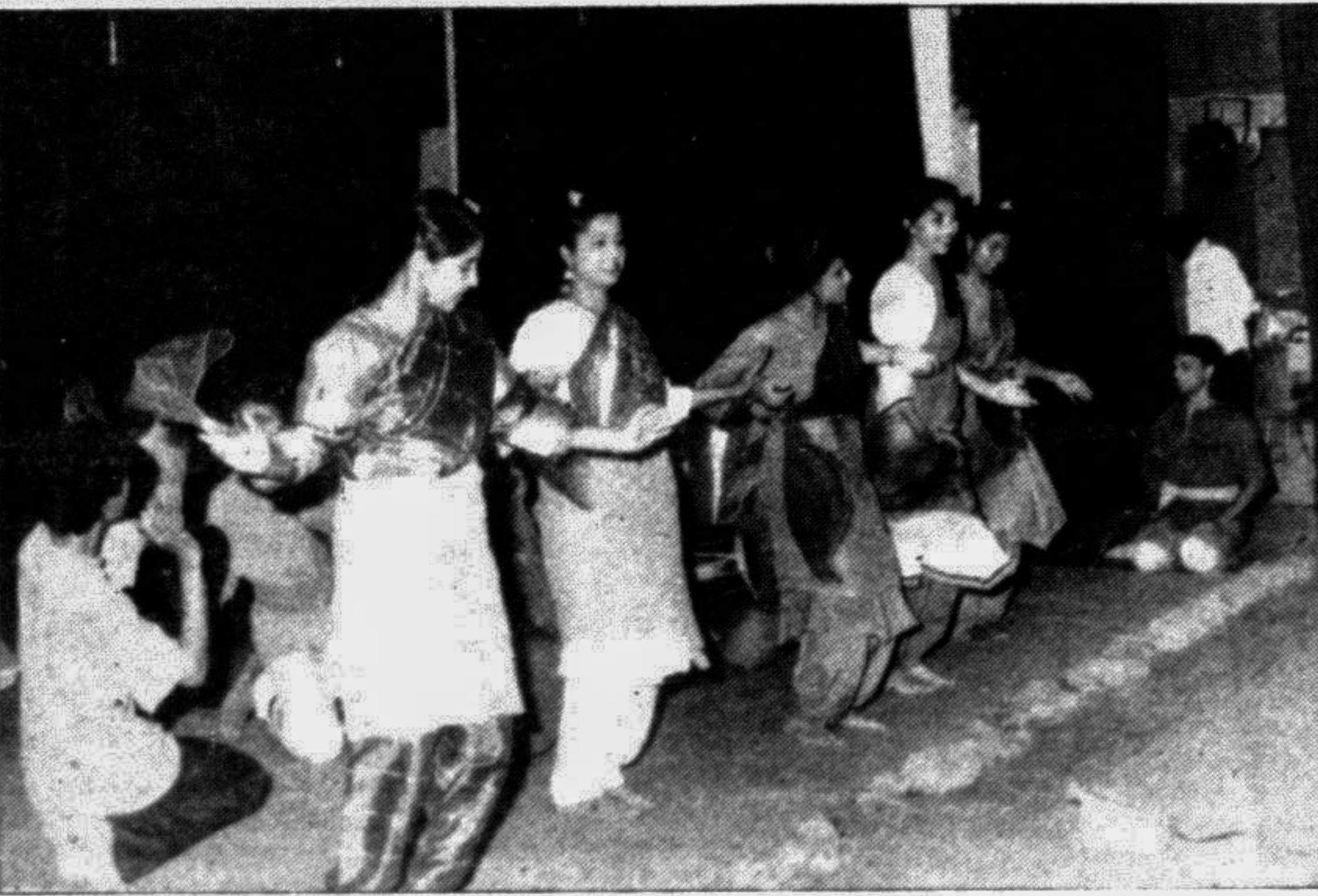
A sequence of drama 'Marma Rupkatha' by Selim-Al-Din at the Shilpakala Academy auditorium yesterday in observance of Bengali year 1400.

Paying him his fare with a little extra, I trudged along the sidewalk. After a while, I remembered that I have forgotten to ask the name of the man behind the wheel, who had borne me for quite some time.