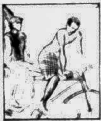
Tears Behind The Wheels Page 3