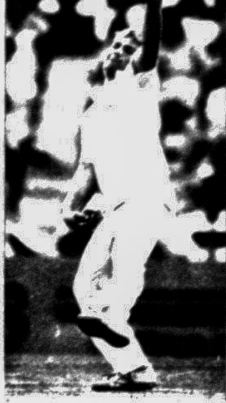
WARNE ... 4 for 54 Waugh through his legs.

Thursday, it was 2.50 pm before Tufnell bowled Mark