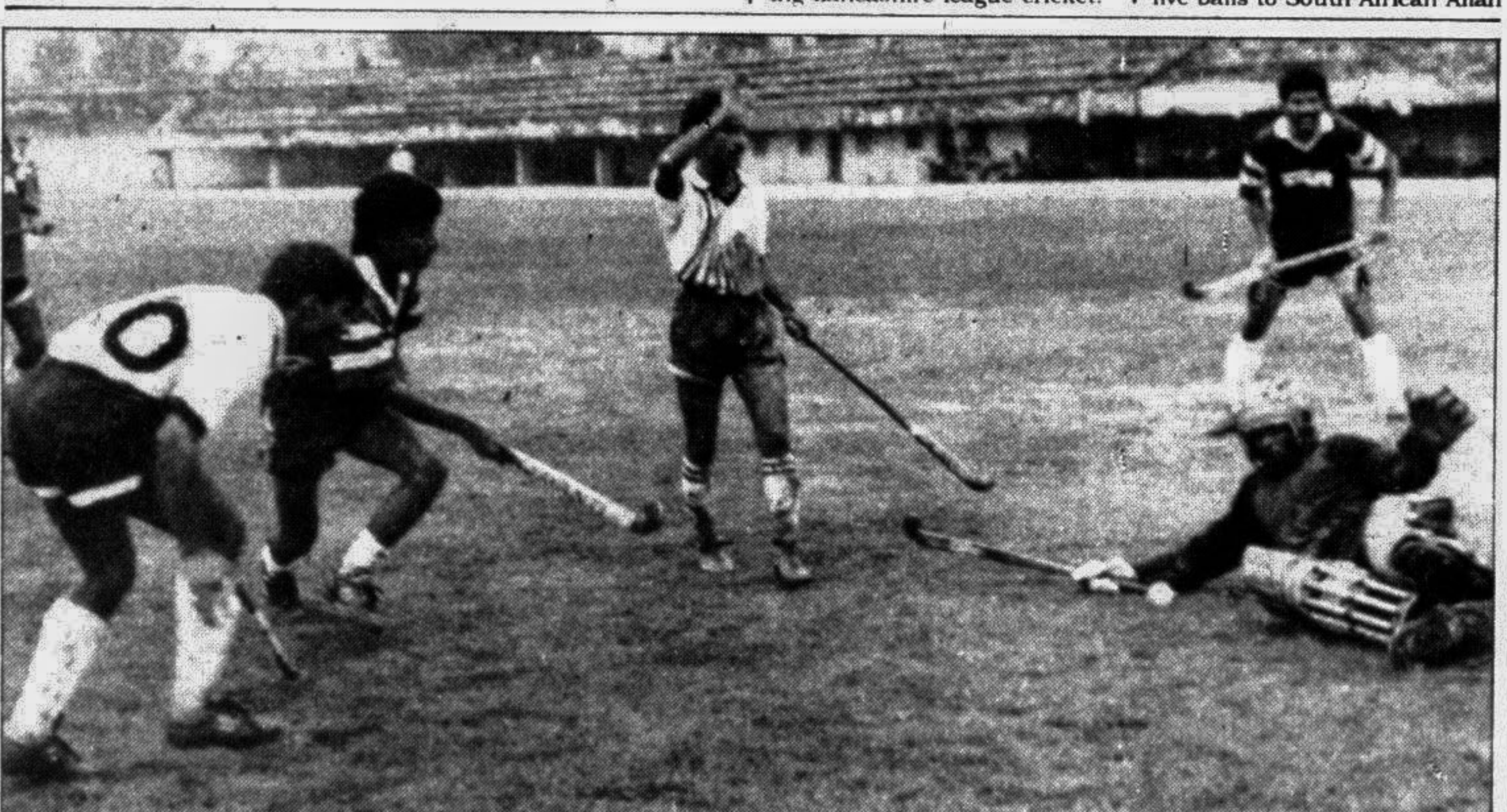
Wanderers custodian is aground to thwart a Mohanmedan move in yesterday's solitary match of the Green Delta First Division hockey league at the Hockey Stadium yesterday.

A custom-made one-metre (three feet) high Cup, similar to ice hockey's Stanley Cup went missing leaving red-faced organisers desperately looking for another trophy to present to the winner Sunday.