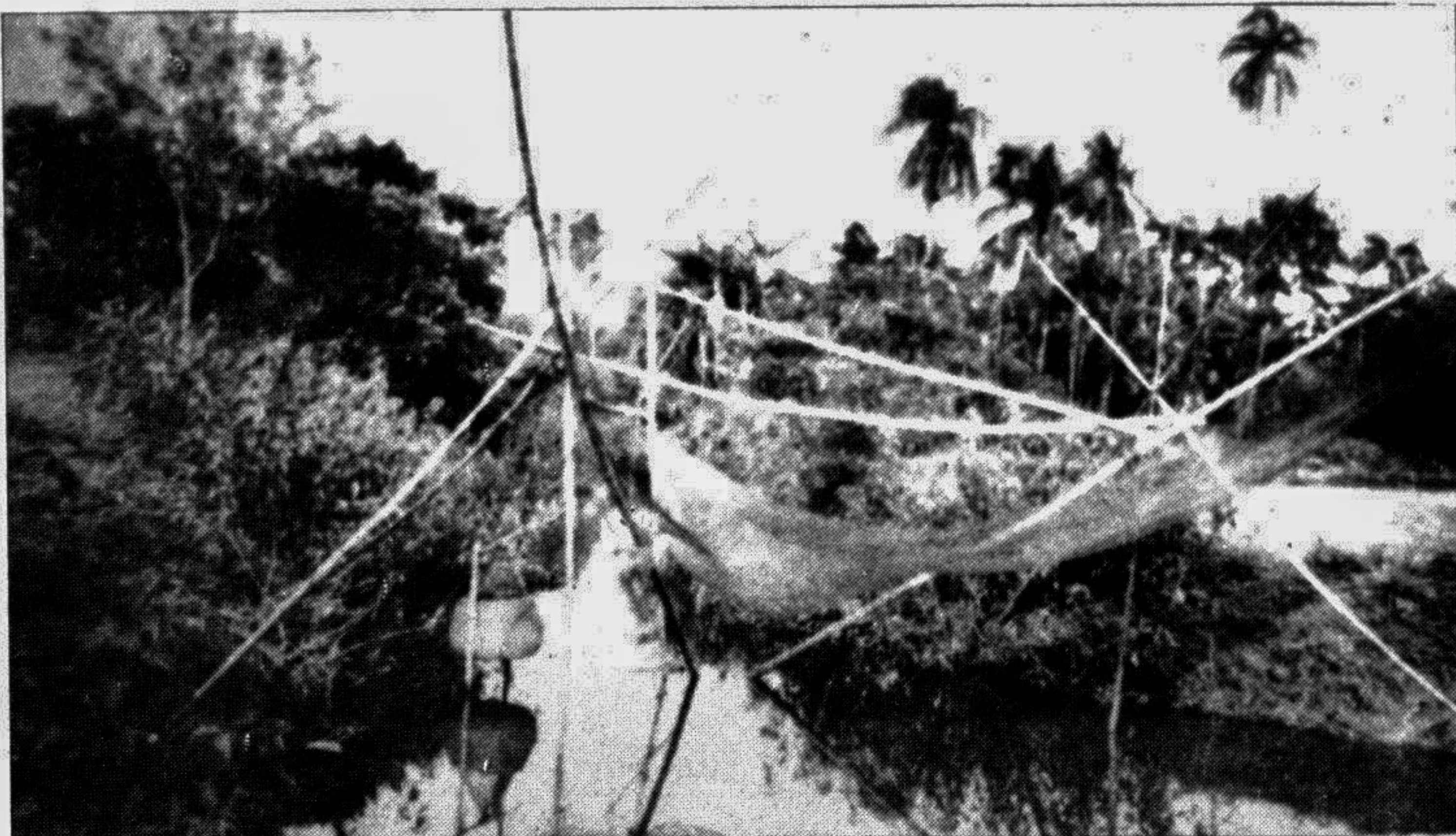
MADARIPUR: Scarcity of fish has put local fishermen almost out of business for quite some time. Here is an example of a fishing net lying idle in Tubia area of the district.