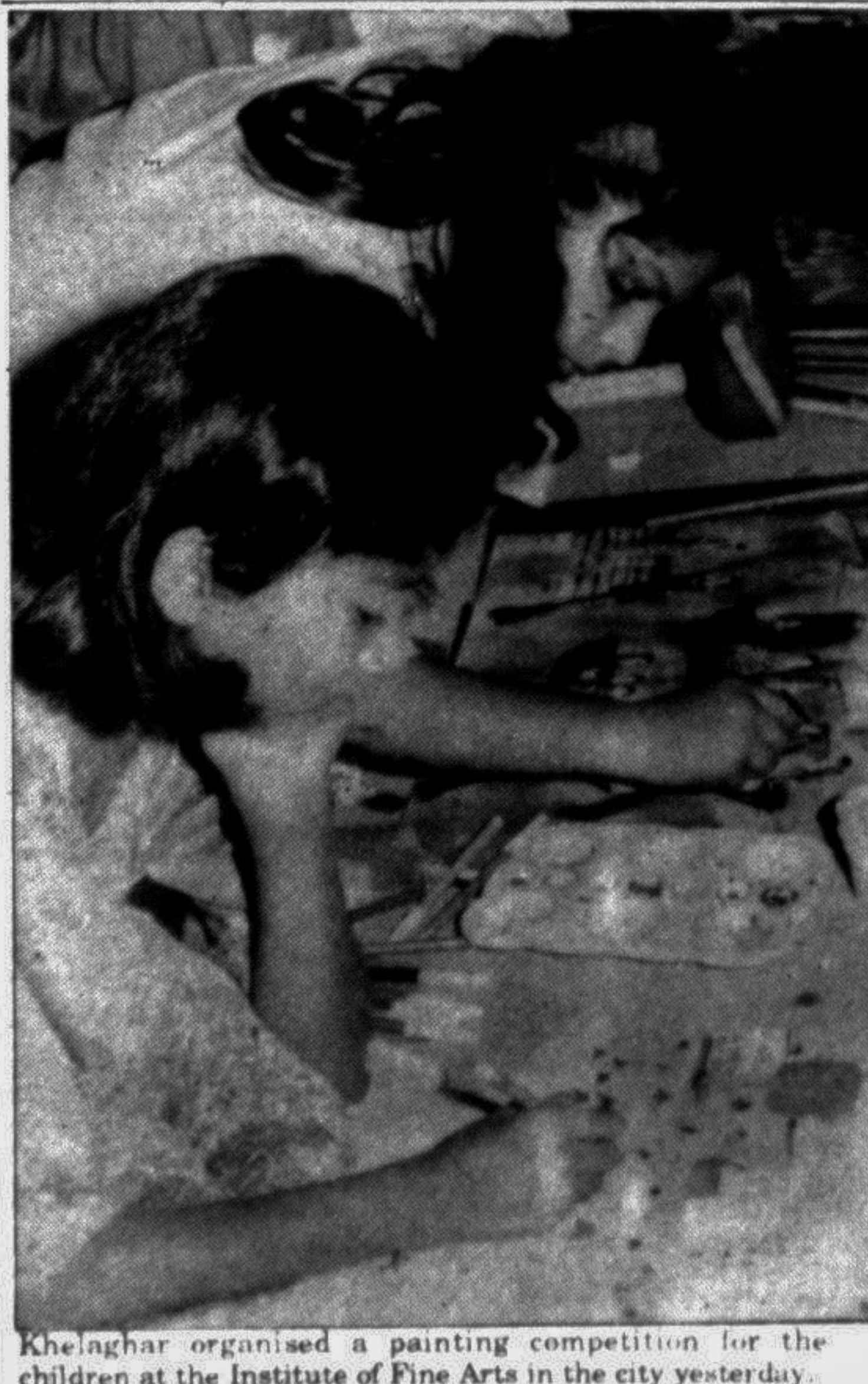
Khelaghar organised a painting competition for the children at the Institute of Fine Arts in the city yesterday.