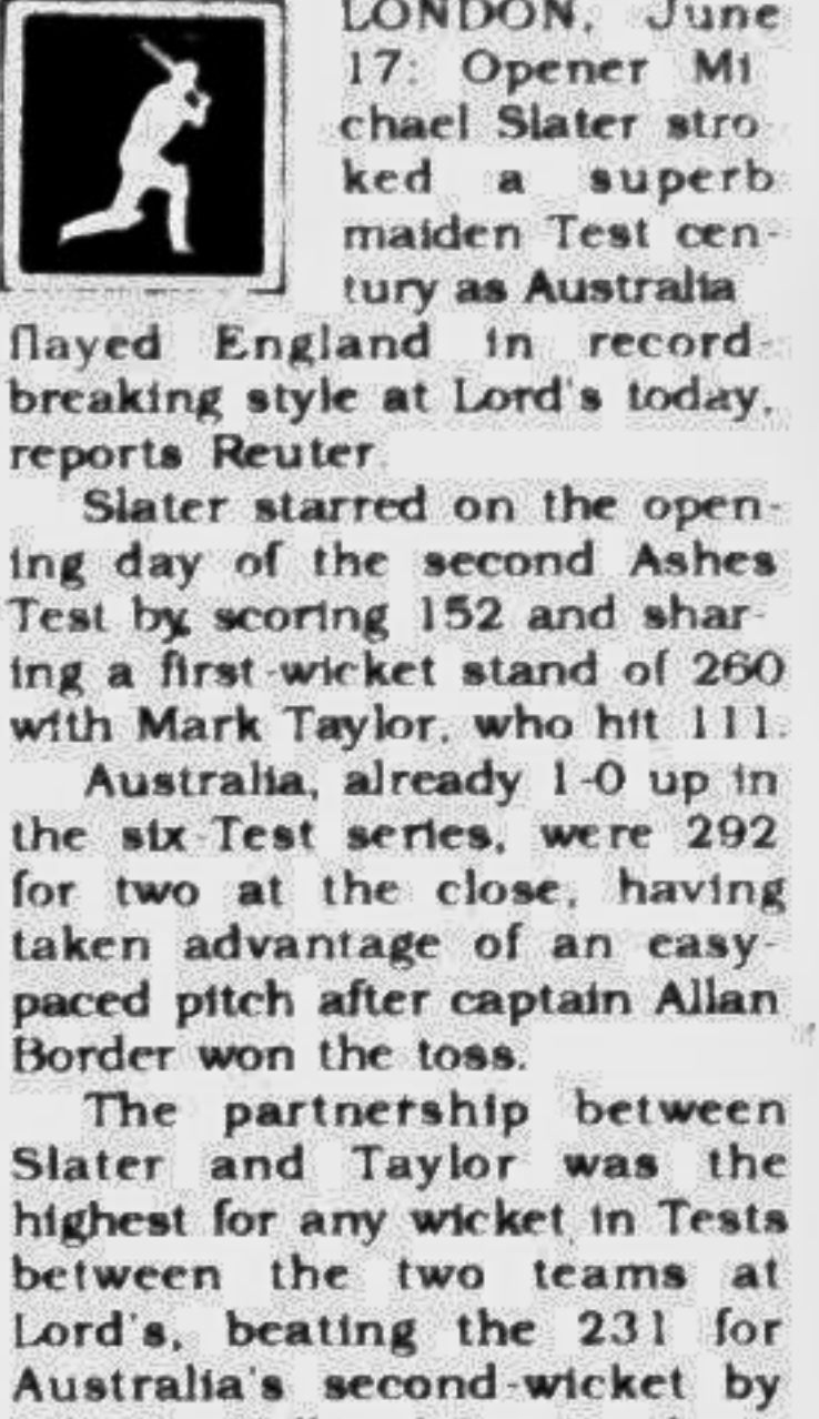
MARK TAYLOR... 111

LONDON, June 17: Opener Michael Slater stroked a superb maiden Test century as Australia played England in record-breaking style at Lord's today, reports Reuter. Slater starred on the opening day of the second Ashes Test by scoring 152 and sharing a first-wicket stand of 260 with Mark Taylor, who hit 111. Australia, already 1-0 up in the six Test series, were 292 for two at the close, having taken advantage of an easy-paced pitch after captain Allan Border won the toss. The partnership between Slater and Taylor was the highest for any wicket in Tests between the two teams at Lord's, beating the 231 for Australia's second-wicket by Bill Woodfull and Don Bradman in the 1930 Test. When Slater reached his hundred in only his second Test, he punched the air as he ran down the wicket, jumped up and down, and took off his helmet to kiss the Australian badge in a gesture of uncon-fined joy. Slater fulfilled the ultimate ambition of any international cricketer by making a century on his first appearance at the game's traditional home, watched by a capacity crowd. The New South Wales batsman faced 263 balls and struck 18 fours in his 296-minute innings that featured sumptuous driving, crisp shots off his legs and nimble footwork