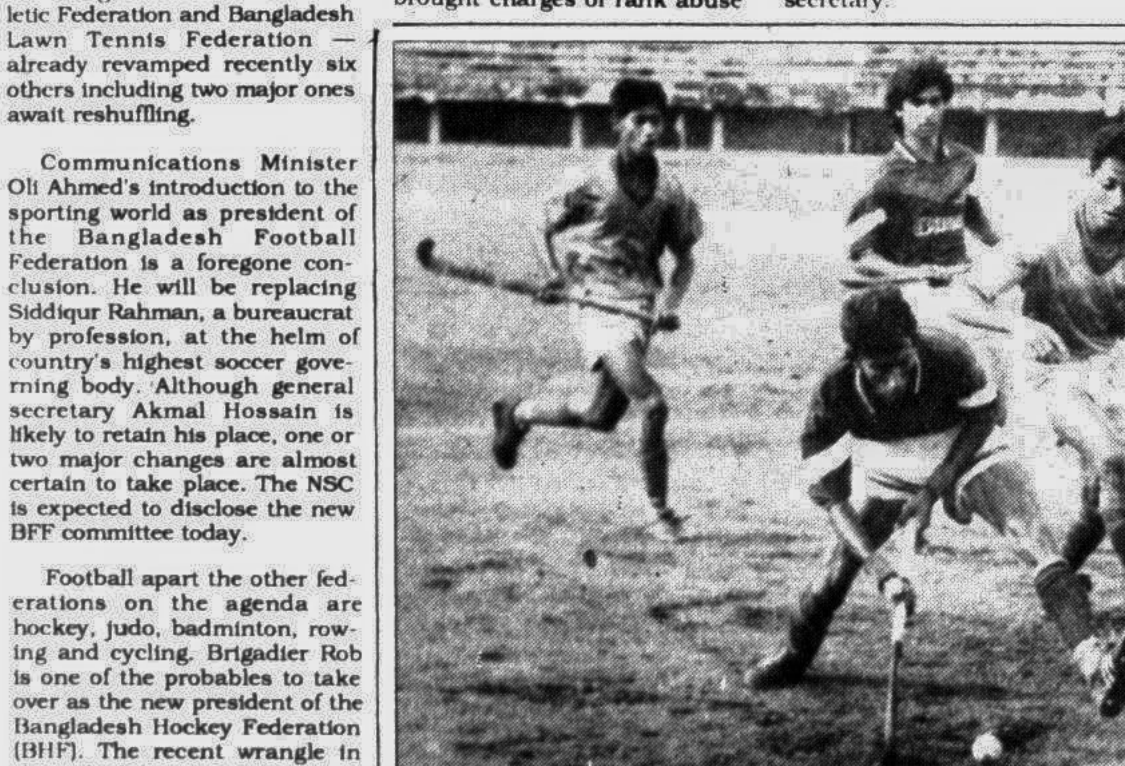
Action from yesterday's Green Delta First Division hockey league match between Sadharan Bima Krira Sangstha and Public Works Department (PWD) SC at the Hockey Stadium. The insuranceemen recorded an impressive 3-0 victory.