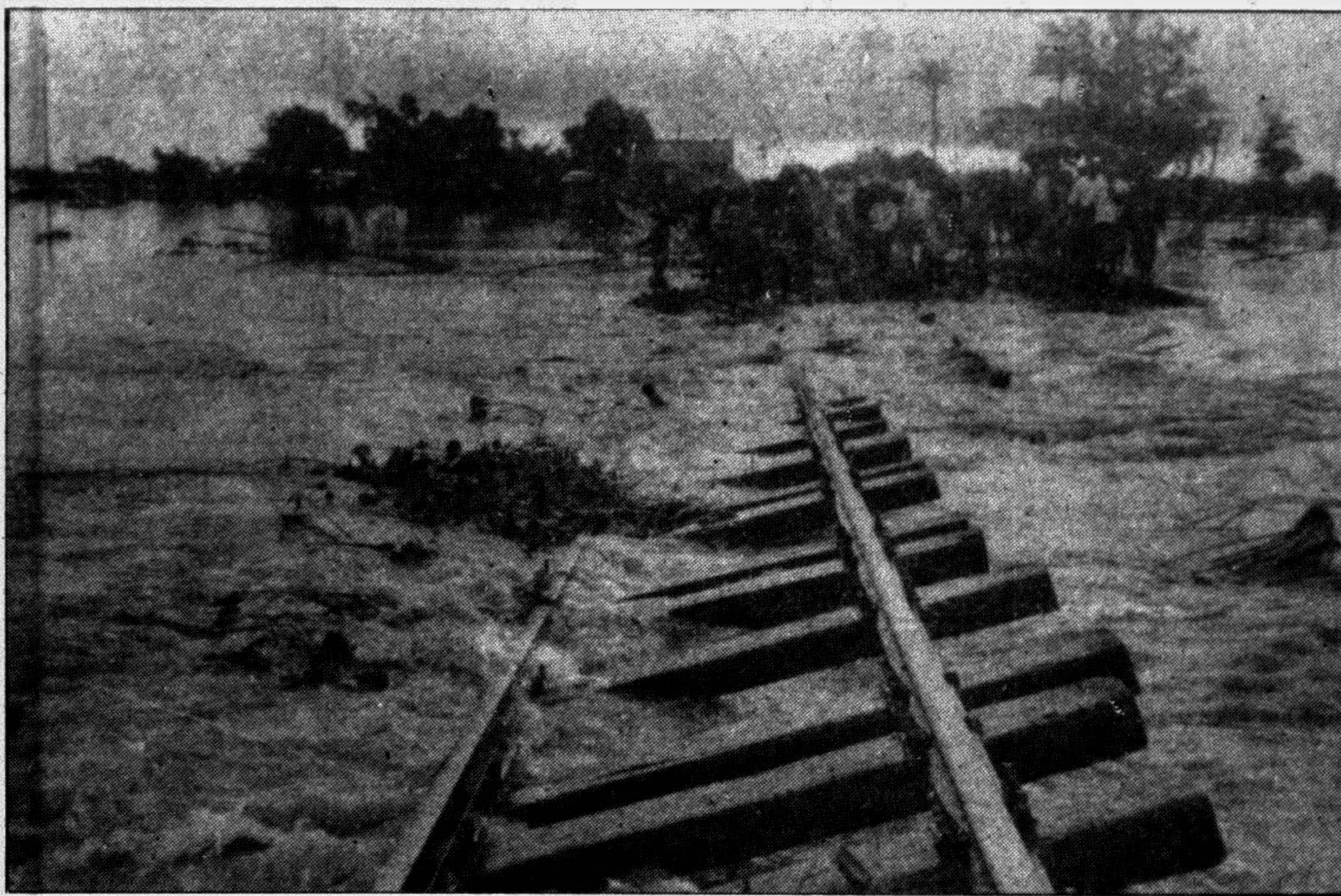
HABIGANJ: Badly damaged railway track near Laskarpur in the district. There are a number of similar scenes throughout the district.