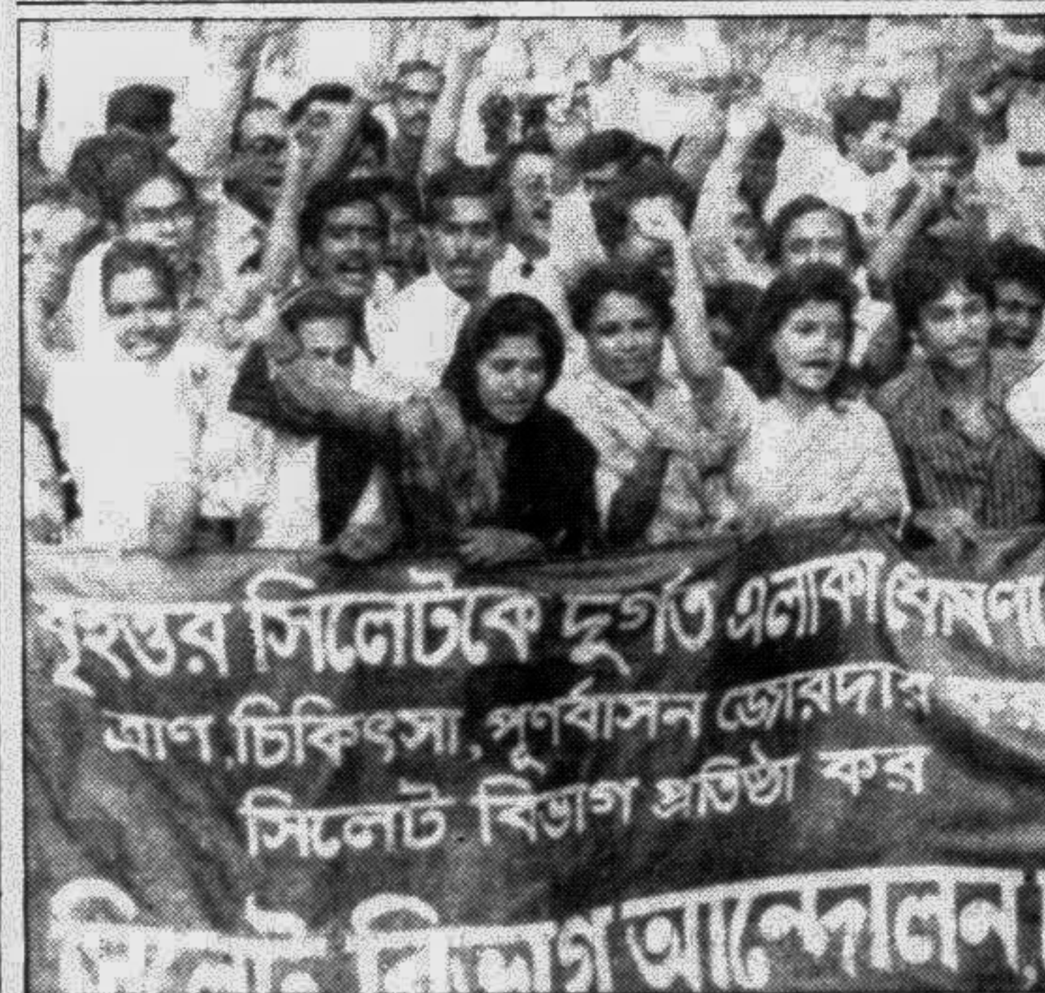
The Movement for Implementation of Sylhet Division brought out a procession in the city demanding declaration of Sylhet as a distressed area.

Bangladesh, he said, recognises the importance of information in nation building and promoting amity among nations.