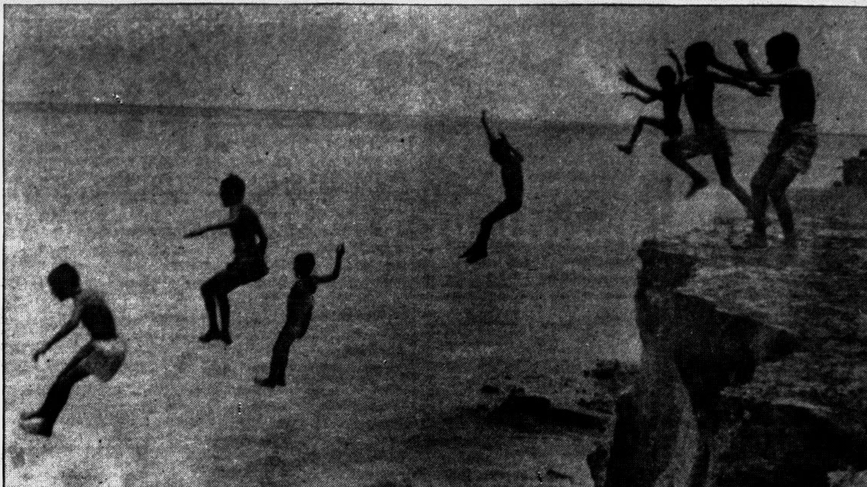
HAVE NO FEAR: These children are enjoying diving in the river Jamuna near Kalihati thana of Tangail district.

Netrokona district anticorruption office sources said the former UP chairman was also the chairman of the project committee of the then Netrokona sadar upazila parishad (abolished) during 1985-86 financial year for the construction of four irrigation pipe culverts at a cost of Taka 38,352 at Baroari Sidi area under the union. The former chairman had misappropriated Taka 20,482 out of the total Taka 38,352 without executing the project properly, the sources said.