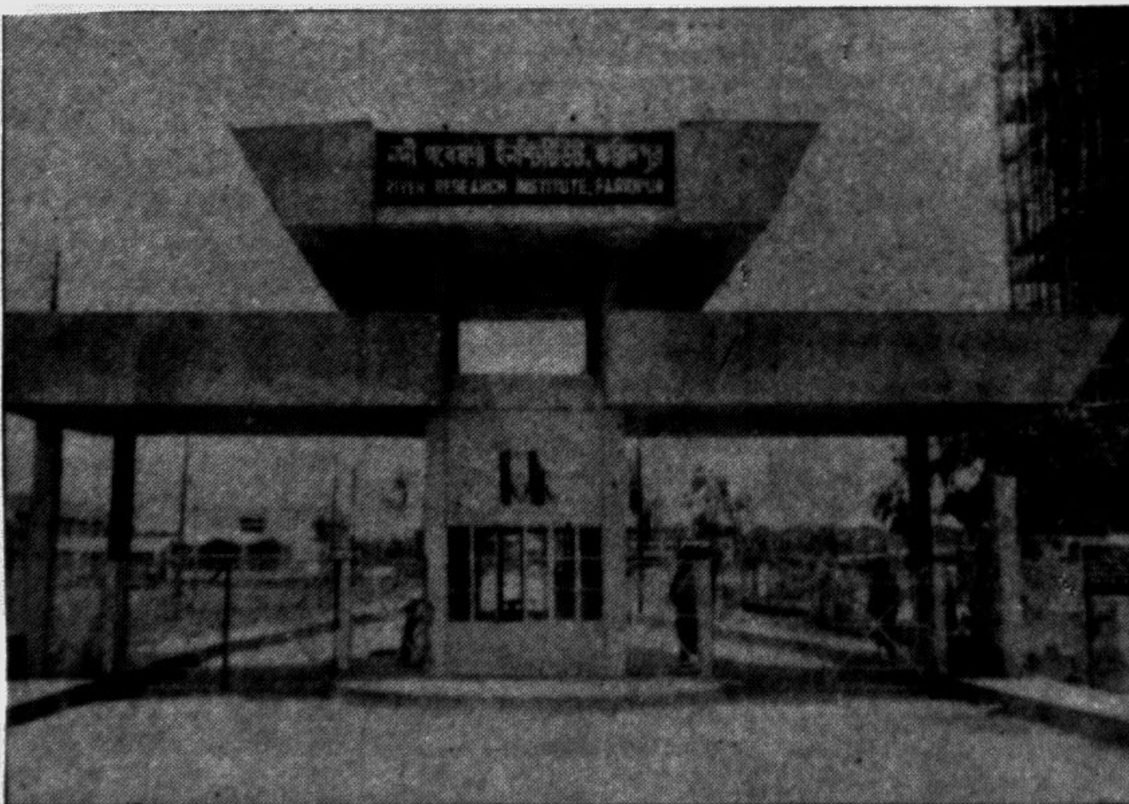
FARIDPUR: The River Research Institute, located just 10 kilometers away from the main Faridpur town, was set up to study various problems of rivers in the country. There are a number of model rivers on which experts carry experiments to find out effects of waves, erosion, rise and decline in water levels. A number of foreign scientists are working together with local scientists. Construction works of a number structures and buildings still remain incomplete.

It is further reported that most of the cooperative societies are managed by non-fishermen group.