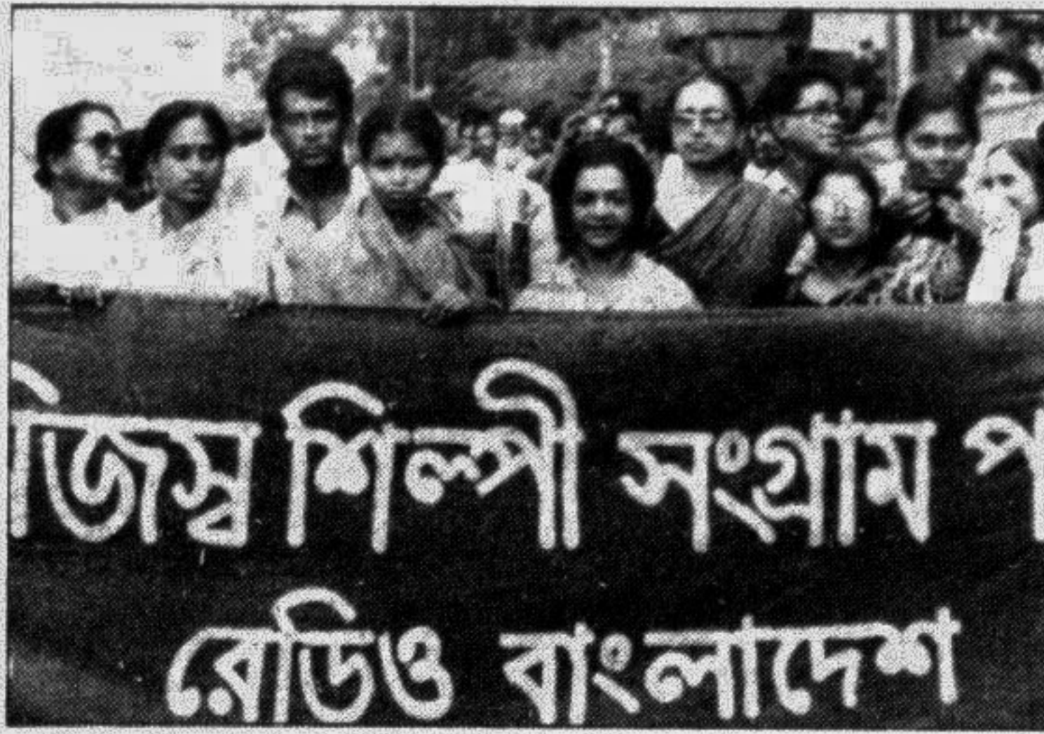
Radio Bangladesh Shilpi Parishad brought out a procession in the city yesterday demanding introduction of pension for them.