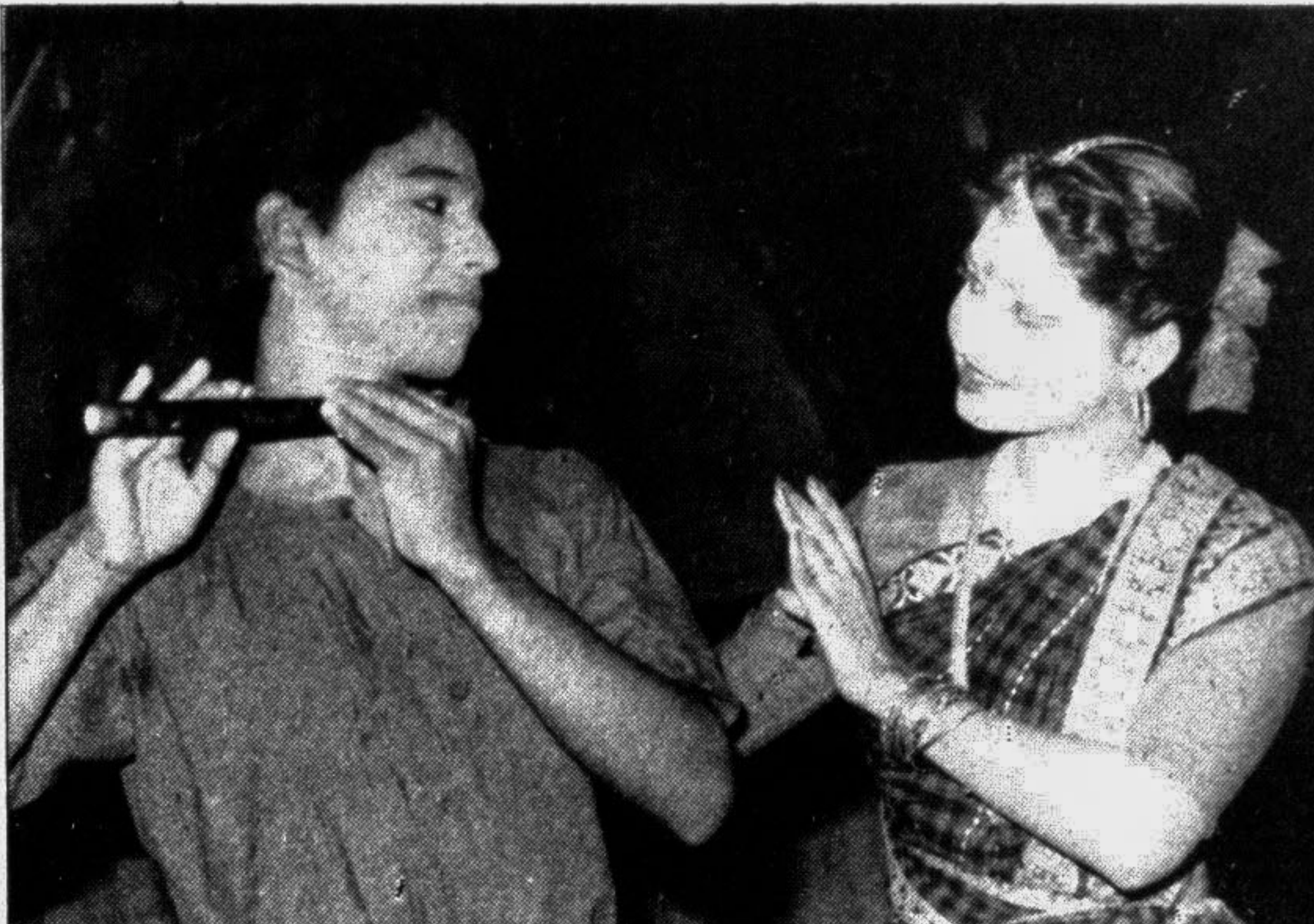
A sequence of dance drama titled 'Kusumer Swapna' presented by the artistes of Bangladesh Ballet Troup at the Shilpakala Academy auditorium in the city yesterday.

Europe and other Muslim minority countries including India in the name of "ethnic cleansing," which was a new world in world dictionary.