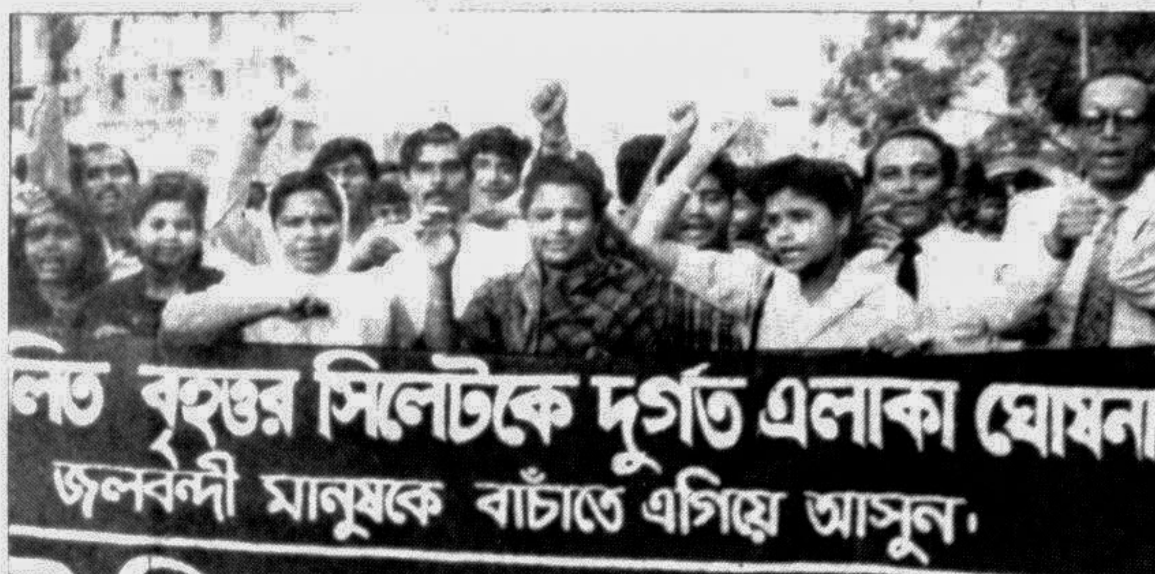
Members of the Greater Sylhet Division, Implementation Committee brought out a procession in the city yesterday demanding the region be declared a 'Distressed Area'.

Published by the Editor on behalf of Mediaworld Ltd., 52 Motijheel C/A, Dhaka-1000 and printed by him at The Sangbad Ltd., 36 Purana Paltan, Dhaka. Editorial, News & Commercial Offices: House No. 11, Road No. 3, Dhanmondi B/A, Dhaka-1205. PABX: 500092-4. Advertisement: 500091 (Direct) Fax No. 88-02-863035. GPO Box No. 3257. GRAM: DAILY STAR DHAKA.