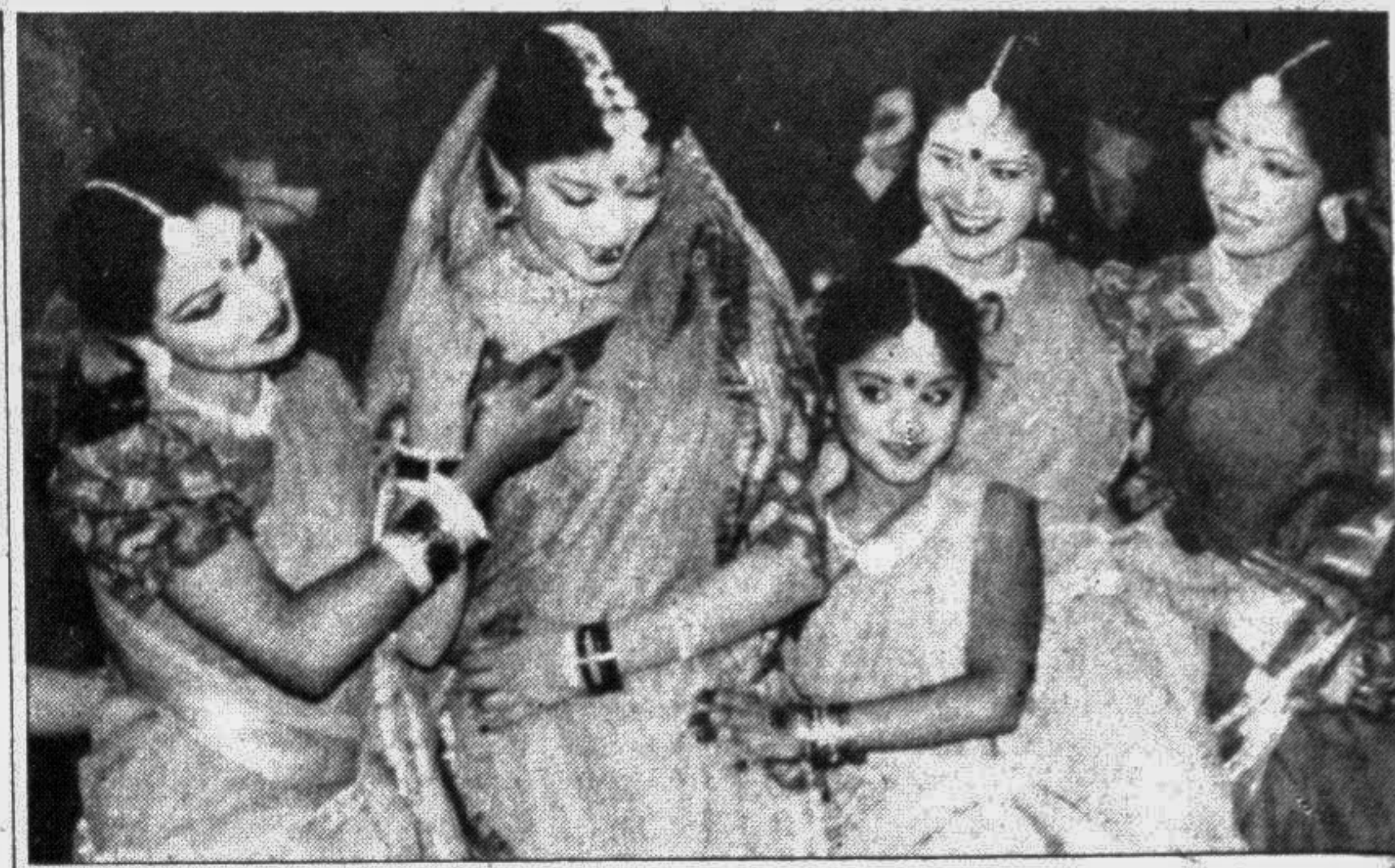
A sequence of the Nakshi Kanth Math (Field of Embroidered Quilt) presented by the artistes of BFAA at the Shilpakala Academy Auditorium in the city yesterday.

Editors and senior journalists took part in the discussions at the working sessions of the seminar.