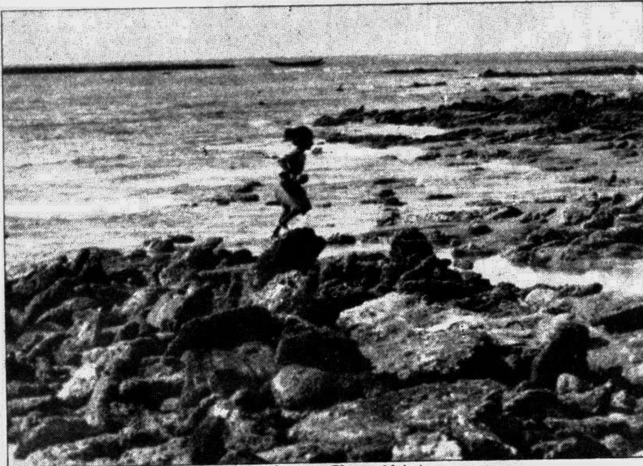
Born free but...