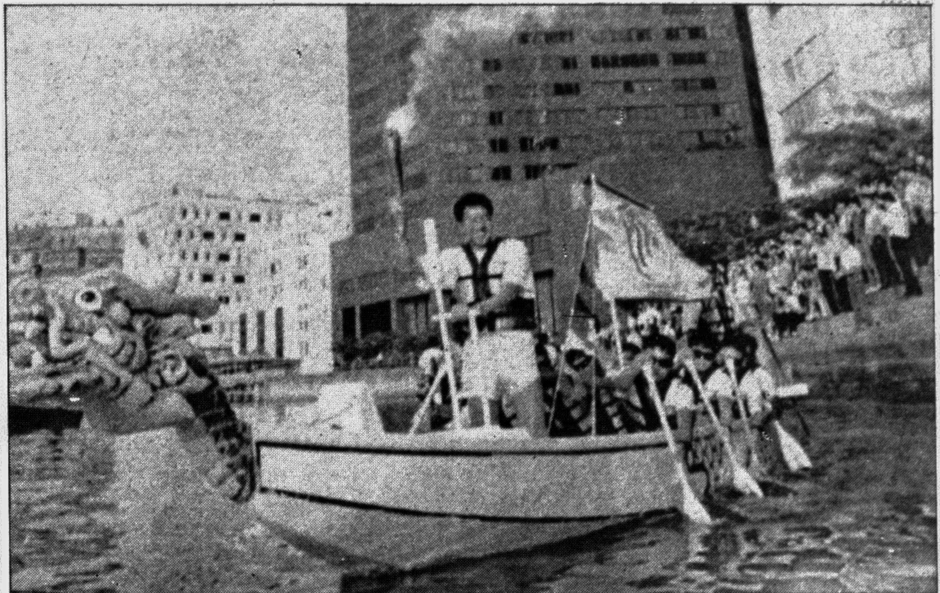
Singapore Minister for Trade and Finance Teo Chee Heam holds the torch for 17th Southeast Asian Games as he stands on a dragon boat during the torch relay on Friday. The 500 km relay covering the whole of Singapore ended yesterday with the opening ceremony at the National Stadium.

The two teams will meet again on Sunday.