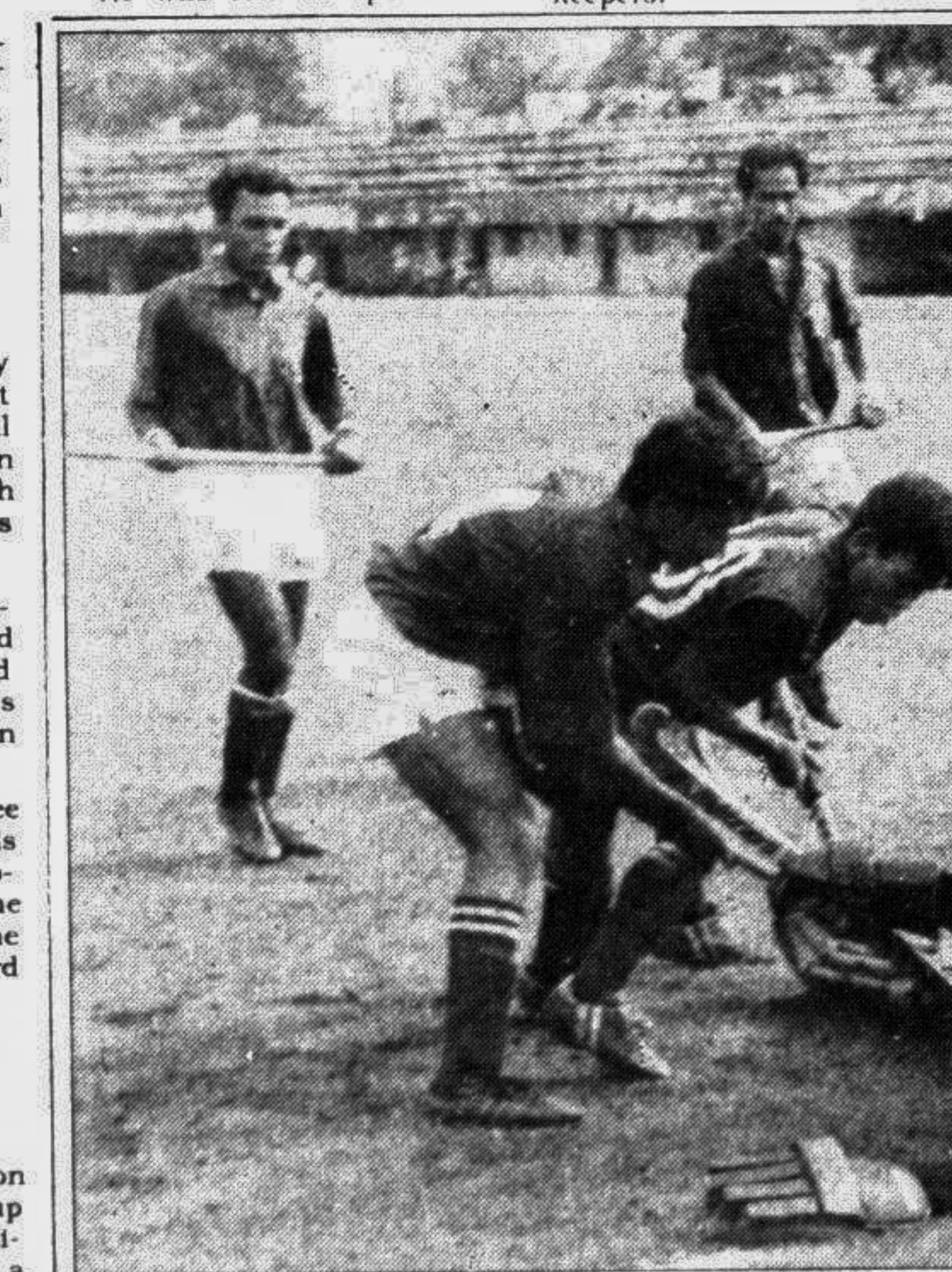
A goalmouth scramble during yesterday's Green Delta First Division hockey league match between Dhaka Ansars and Sonali Bank at the Hockey Stadium. The match ended one-all draw.

LONDON, June 12: Ray Kennedy, one of Britain's most honoured footballers, is to sell his remarkable medal collection to help him in his struggle with Parkinson's Disease, reports AFP. Kennedy, who enjoyed a glorious career with Liverpool and Arsenal, hopes to collect around 70,000 pounds when his medals are sold at auction in Glasgow later this year. Among the prizes are three European Cup Winners' medals from his playing days at Liverpool and the FA Cup/league championship "Double" set he won as a 19-year-old forward with Arsenal.