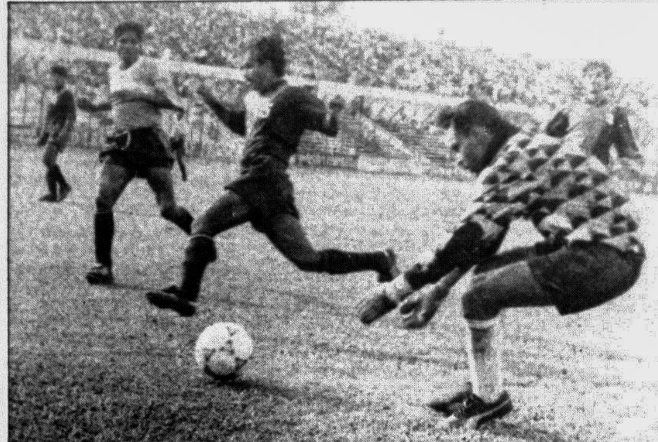
Action from the Star First Division football league match between Farashganj Sports Club and Bangladesh Boys Club at the Dhaka Stadium yesterday. Farashganj won the match by a solitary goal.