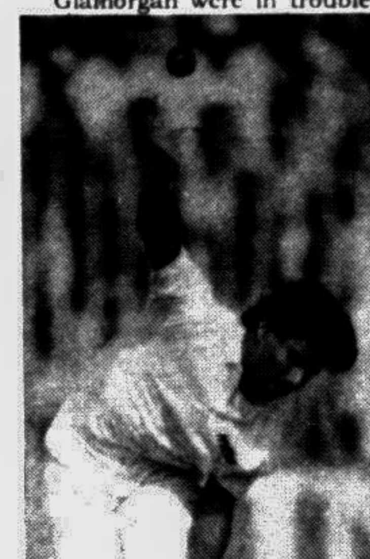
Waqar Younis right from the start as they slumped to 24 for five and only

LONDON, June 12: Waqar Younis showed why he is the world's top-rated bowler by picking up his second five-wicket haul of the season as Surrey took charge against joint county championship leaders Glamorgan at the Oval on Friday, reports Reuter. The Pakistani pacesetter took five for 60 to help shut out Glamorgan for 166, deficit of 116. England vice-captain Alec Stewart weighed in with six catches behind the stumps. Surrey then stretched their advantage by another 39 runs