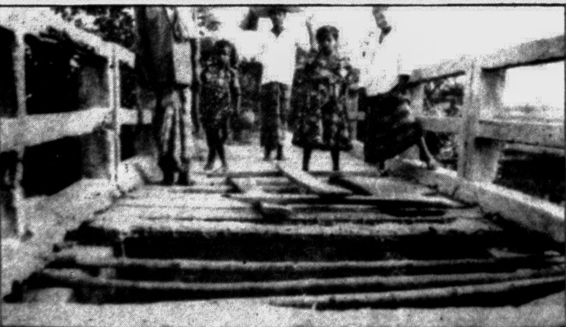
MADARIPUR: This bridge was constructed only 12 months back. Built for pedestrians who mostly use the bridge to cross a small stream. The fragile condition of the bridge, located in Chirapara area, is said to be ignored by the local administration despite repeated calls for repairing.