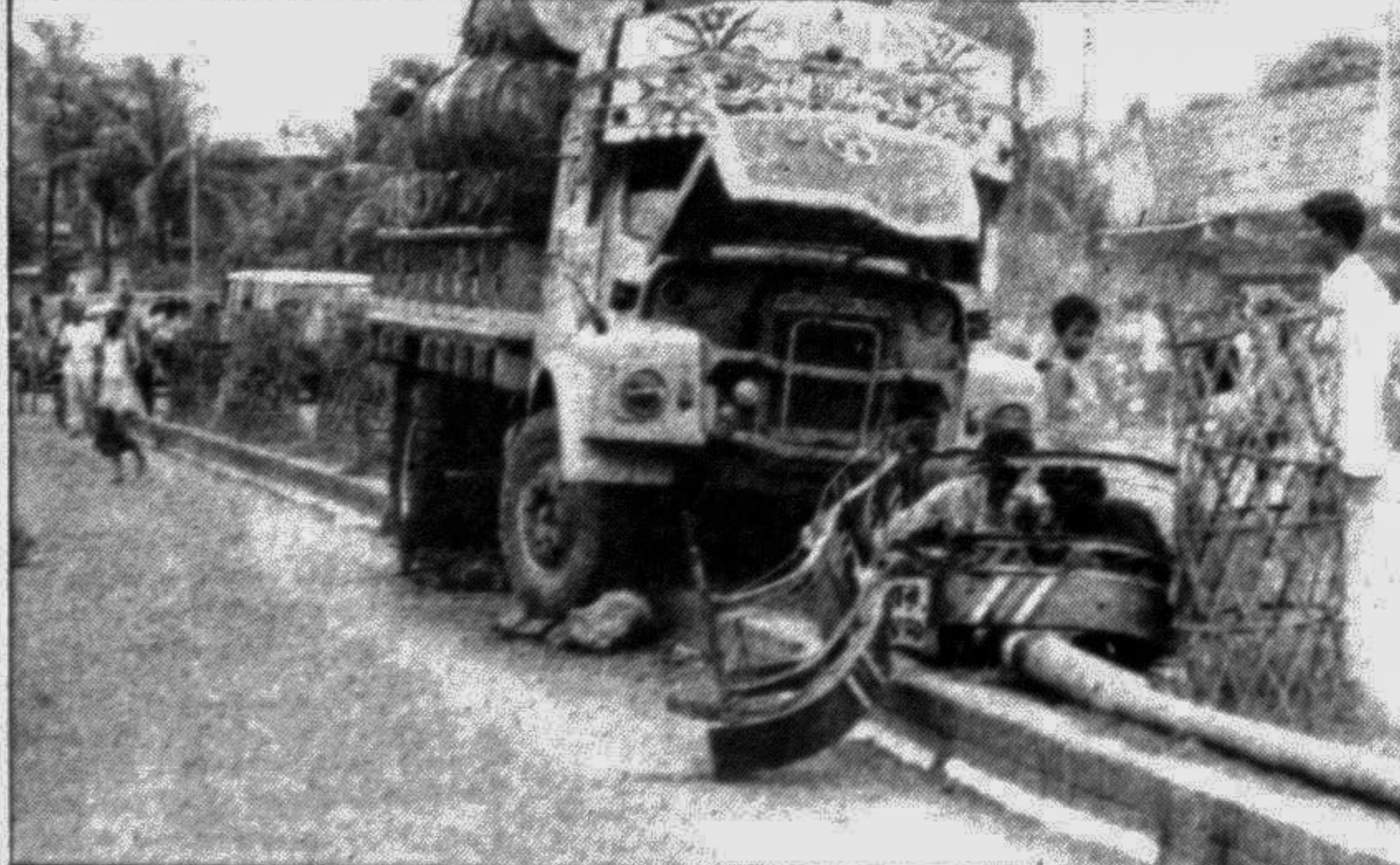
The truck which lost control near the Orthopaedic Hospital at Shyamoli Thursday lying on the pavement even yesterday.