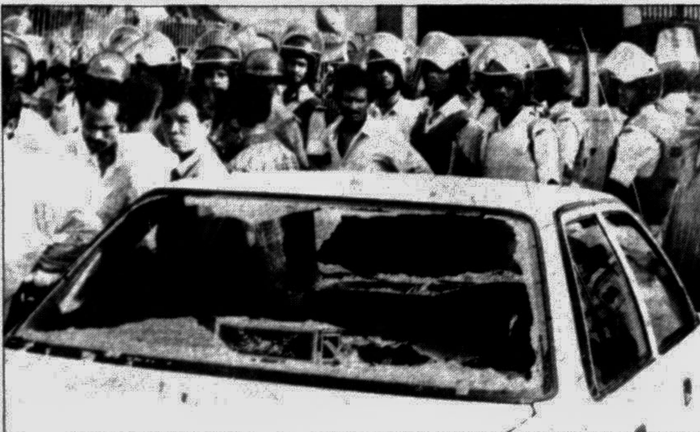
Jatiya Party activists went on a rampage in the city yesterday, damaging this vehicle in front of the Head Office of the Agrani Bank at Motijheel.

One can only wish him luck at his new venture and hope that he will come back soon to create some more dynamic works to fascinate the art lovers in the city.