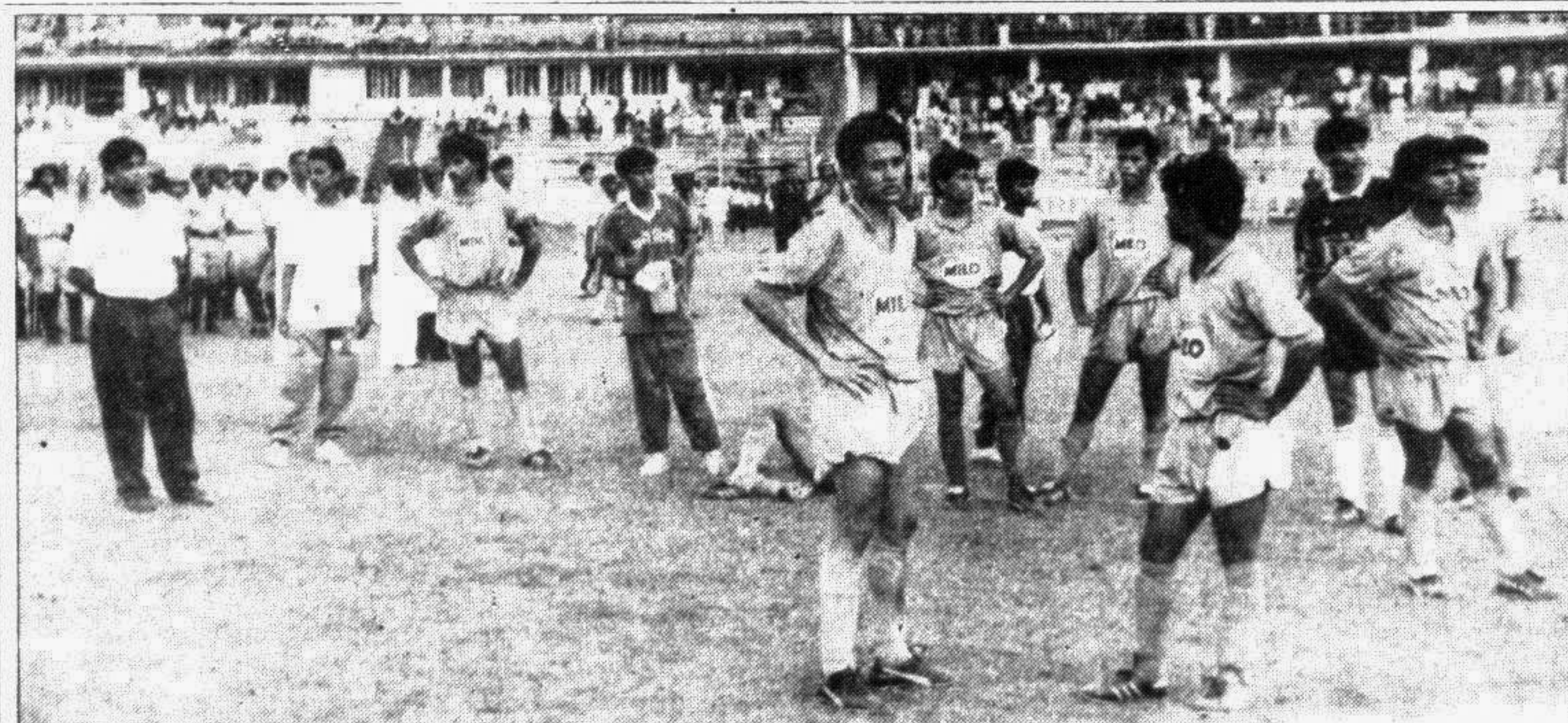
A FAMILIAR SIGHT... Players and officials of Abahani waits for agitated fans to cool down yesterday during their league opener against PWD at the Dhaka Stadium yesterday. The match was halted for 32 minutes.

The dreadlocked star, who will be 31 in December, has been dogged by knee injuries since 1989, was offered a one-year contract extension by the club but decided to leave rather than accept a reported 50 per cent payout.