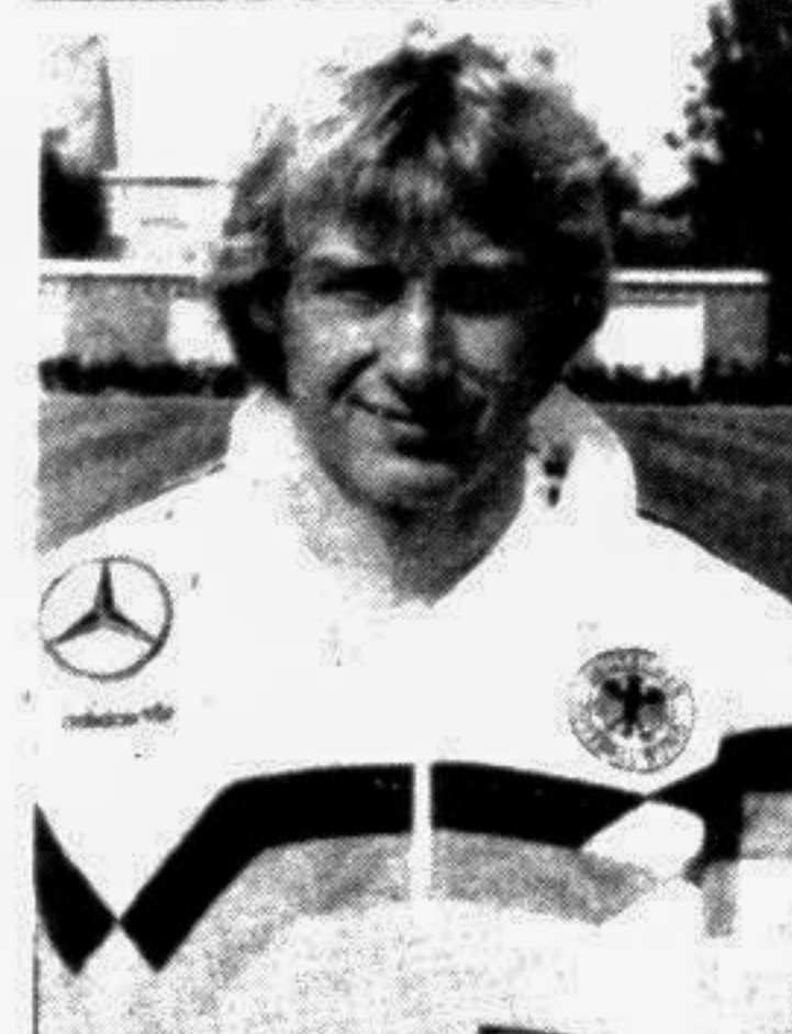
KLINSMANN... 2 goals

In the second half, Germany put in Karlheinz Riedle to partner Klinsmann up front and the