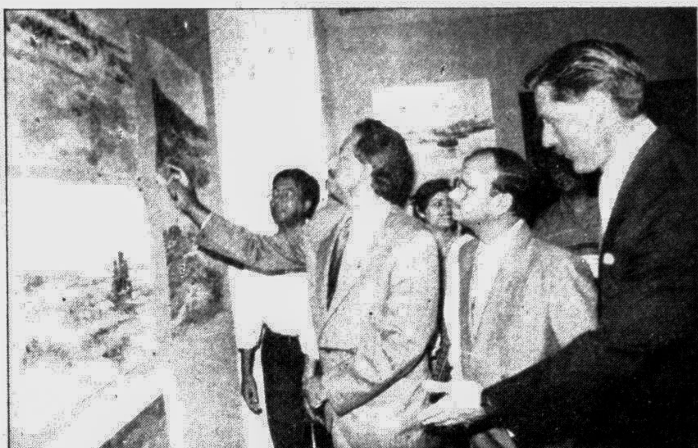
State Minister for Civil Aviation and Tourism Abdul Mannan inaugurated a three-day watercolour exhibition at Hotel Sonargaon yesterday.