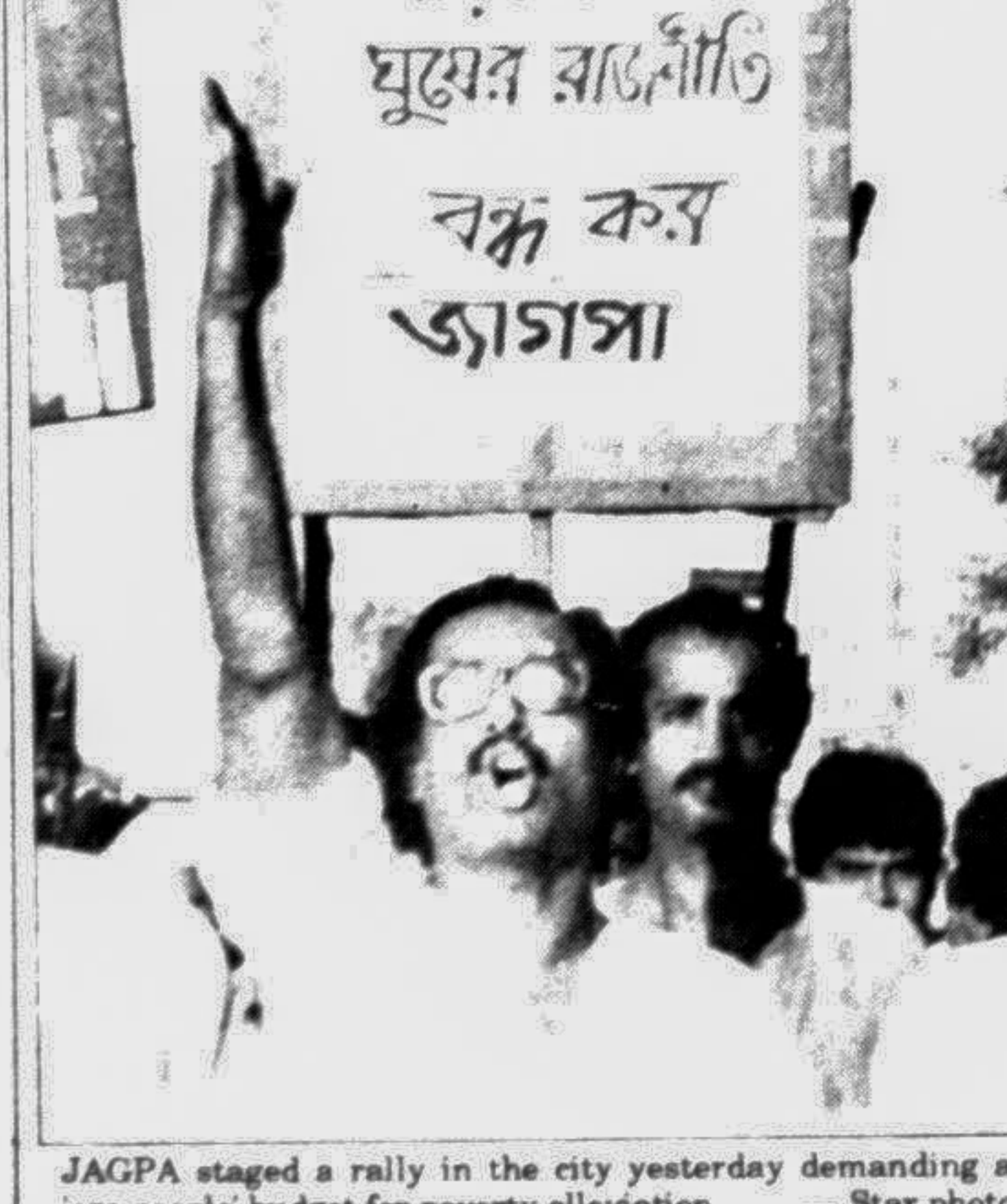
JAGPA staged a rally in the city yesterday demanding a 'pro-people' budget for poverty alleviation.