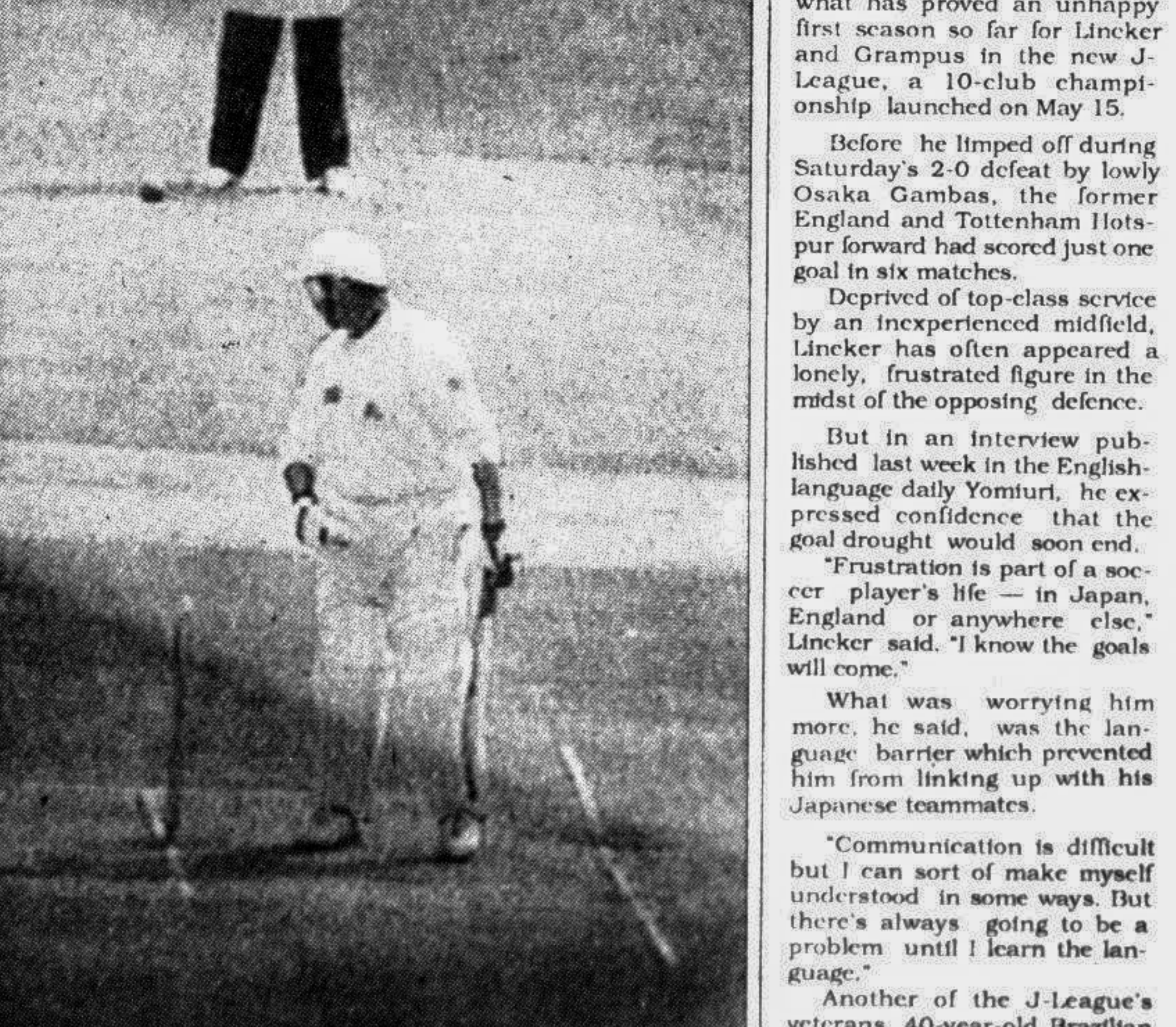
England skipper Graham Gooch begins his long walk back to the dressing room after being given out handled the ball during the fifth and final day of the first Ashes Test on June 7. Gooch, who parried the ball away when an inside edge headed for the stumps, made 133.