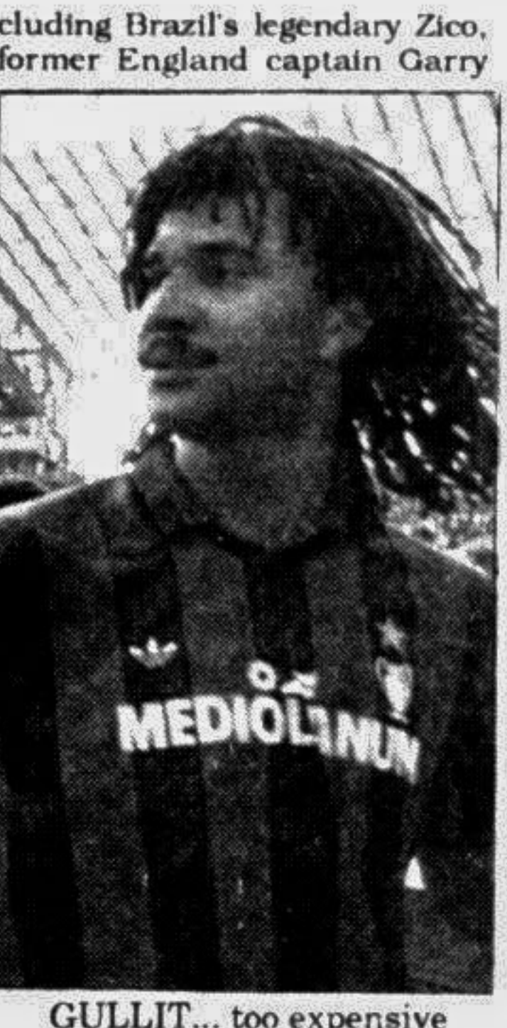
GULLIT... too expensive